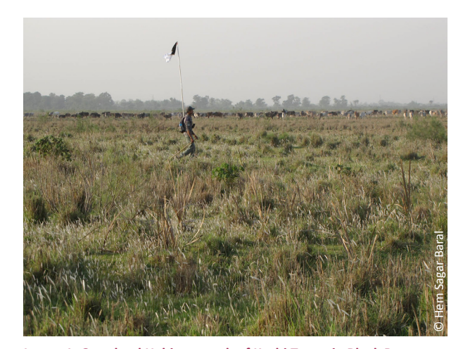
Image 1. Grassland Habitat, south of Koshi Tappu in Block B. Livestock in the background and survey team member seen in the foreground

Reconnaissance trips were made both in the eastern and the western side of the Koshi River between 24 March to 16 April by the staff of the Koshi Tappu Wildlife Reserve and Kosi Bird Observatory. On 21 and 22 April 11 surveyors, on 23 April, nine surveyors, and from 24 till 26 April, 12 surveyors took part in the grasslands survey for floricans. Surveys were conducted on foot after reaching the survey areas either by boats or by a four-wheel vehicle. All four blocks were covered for the survey (Table 1). Not all blocks were completely covered (see previous section). Surveys consisted of walking transects once within each block. A small island in Block B was covered twice, on 1 and 3 May 2012. This was done because of possible disturbance by people already present in the area on the first day of the visit (Image 1). Survey times were between 0500-1000 hr. This coincided with the time period when displaying male floricans were most active, and also when human use of the area was minimal. Major grass species and