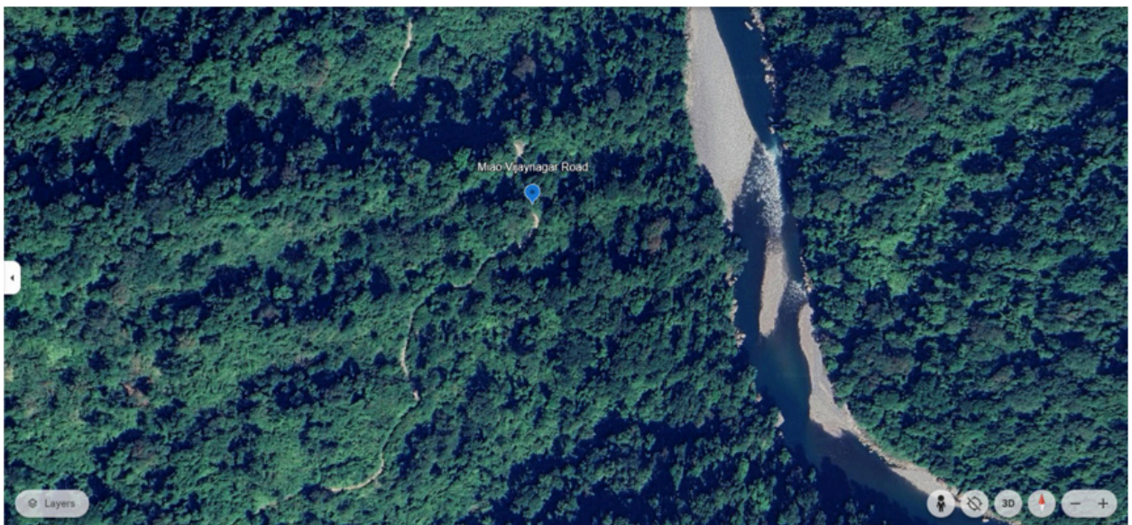
Image 5. Location of Miao-Vijaynagar road within Namdapha National Park and Tiger Reserve.