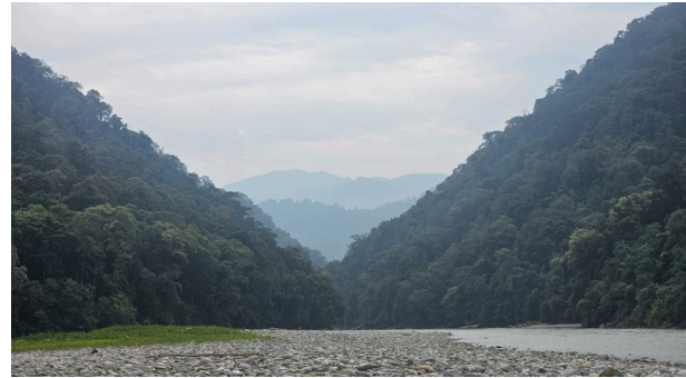
Image 1. Typical landscape of Namdapha National Park and Tiger Reserve in Arunachal Pradesh, India.

days from 10–17 October 2024, with the investigation focusing on riverbanks, forest trails, narrow streams, and waterfall habitats. Random field sampling was undertaken daily from 0500–1900 h along these habitats. Species identification was based on photographic evidence captured using a Nikon D3300 DX-format DSLR