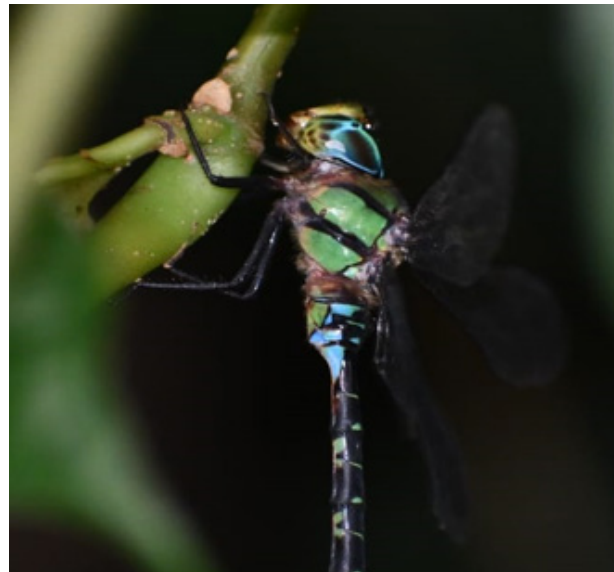
Image 2. Lateral view of male Individual of Gynacantha khasiaca .

The head was pale blue to olive-green eyes, olive-brown labrum and labium, and a light green frons with a distinct black 'T'-shaped marking. The thorax was bright green with two thick blackish-brown stripes on each side. The wings were hyaline with an amber tint at the base; pterostigma covers 4–5 cells. The forewing discoidal cells consisted of five cells, while hindwing discoidal cells ranged 4–6. The abdomen measured about 47–51 mm, with segments 8–10 being entirely black. The anal appendages were black; with inferior appendages about two-thirds the length of the superior appendages (Martin 1909).