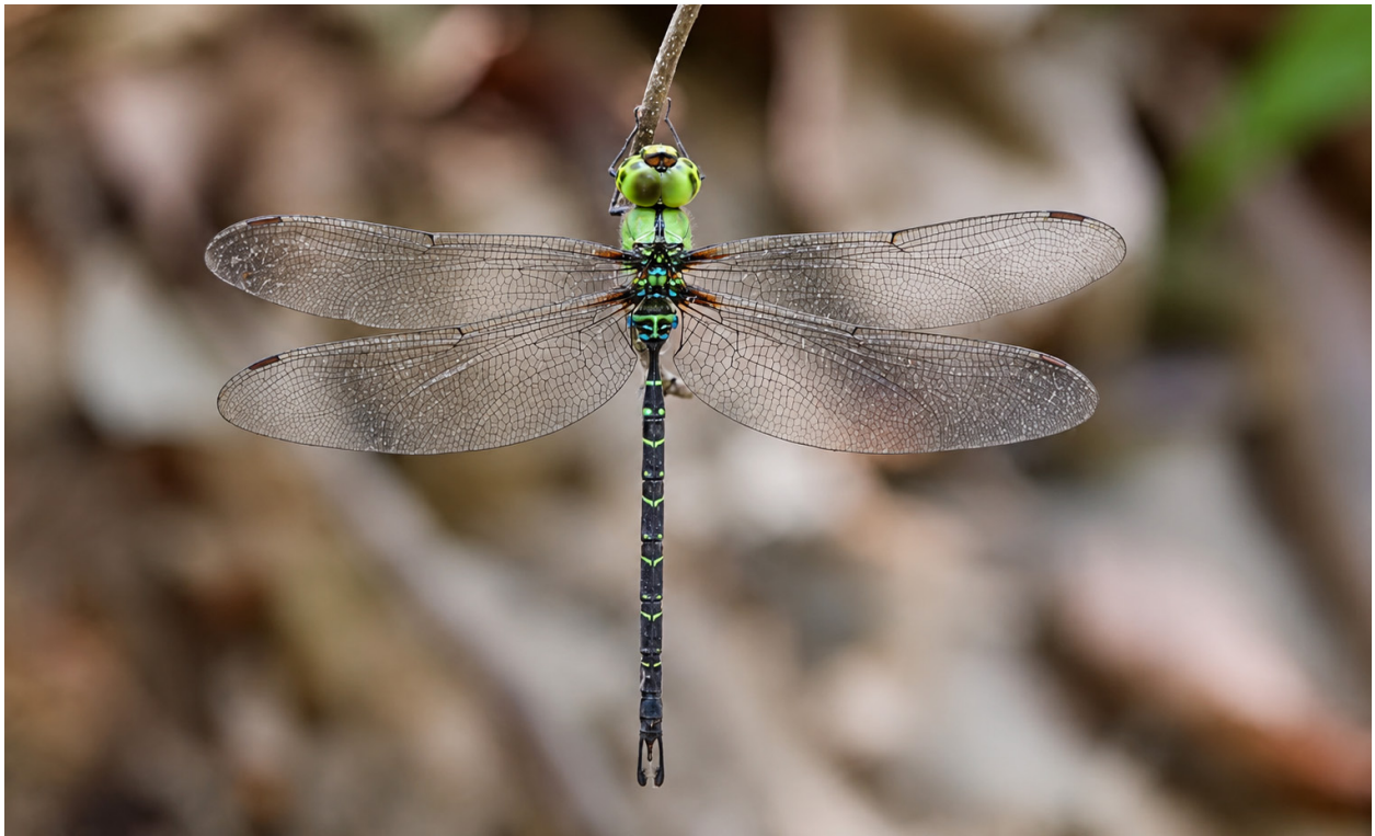
Image 4. Dorsal view of Gynacantha khasiaca (male) individual, highlighting its terminal abdominal appendages.