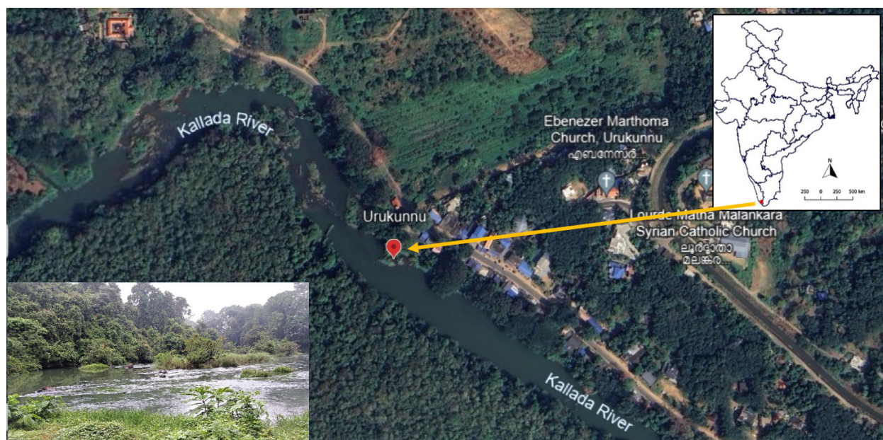
Image 1. Urukunnu Station in the upstream of Kallada River, Kollam District, Kerala, India, the type locality of Heleocoris stephanus sp. nov.

Material examined: Holotype (ZSI/WGRC/I.R.-INV.26976): 07 October 2023, macropterous male, India: Urukunnu station, Kollam District, Kerala, 8.5905 °N & 77.0124 °E, 45 m, upstream Kallada River, coll. Dani & Arya, Paratypes (SSCDZ/Hem01/2024 and SSCDZ/