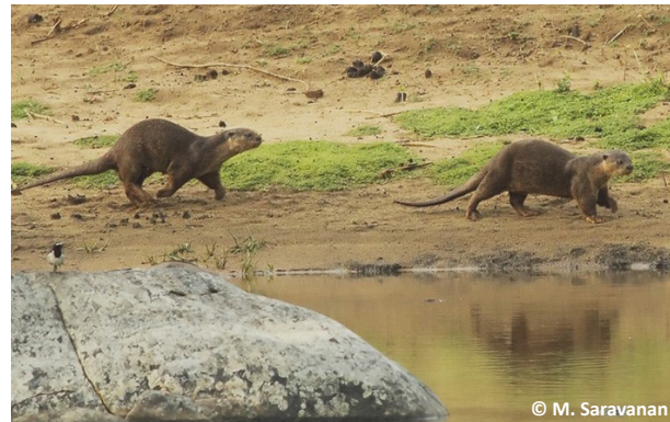
Image 1. Smooth Coated Otter Lutrogale perspicillata

The study was carried out along the Cauvery River within Hosur and Dharmapuri Forest Divisions, stretching from Ichiebara (12.198 N, 77.593 E) to the junction of