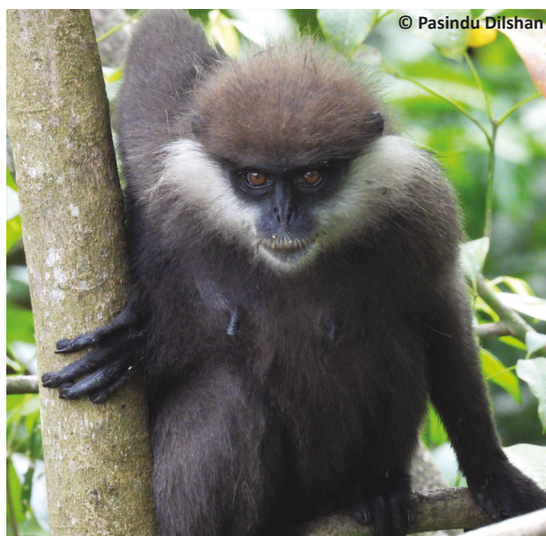
Image 2. One of the 25 most endangered primates of the world, Semnopithecus vetulus nestor .

out to collect data by randomly interviewing families in 12 villages bordering Danawakanda Forest from August 2014 to January 2015. The head of each household was interviewed in the relevant native language, Sinhalese or Tamil, to avoid omission of vital information. The questionnaire was composed of both closed- and open-ended questions and binary (yes/no) questions.