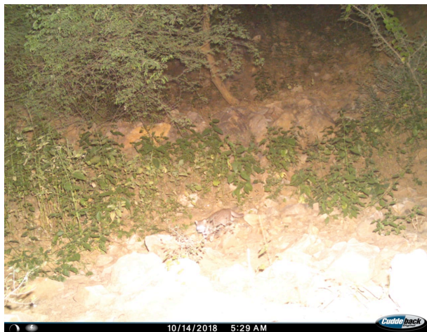
Image 1. Rusty-spotted Cat recorded on 14 October 2018 in Jaipur District, Rajasthan.