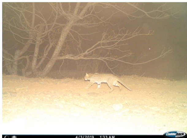
Image 3. Rusty-spotted Cat recorded on 3 April 2019 in Karauli District, Rajasthan.

have protected forests, whereas forests in Dausa, Tonk, and Bhilwara are not protected. To date, no camera trapping survey was carried out in these forests. In view of our records of the Rusty-spotted Cat in thorny and dry deciduous forests in other parts of the Aravalli and Vindhyan Hills, we consider it likely that it will be recorded there as well in future surveys.