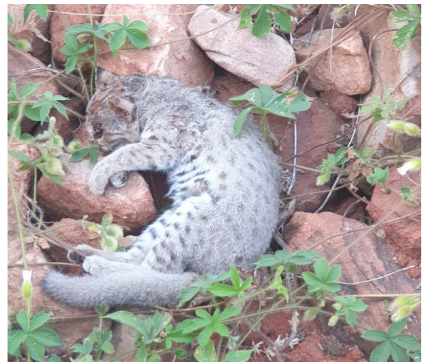
Image 2. Rusty-spotted Cat found dead beside road on 27 October 2019 in Jaipur District, Rajasthan.

the arid climate with sand dunes and sparse vegetation. However, we think it possible that it may be recorded in future in this area as the habitat is expected to change from xeric to mesic due to the construction of the Indira Gandhi Canal (Prakash 1986; Chandrakasan et al. 2010).