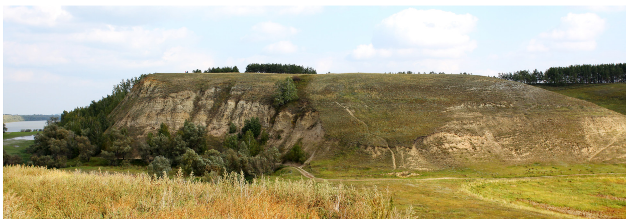
Image 2. The locality where the queen specimen of Bombus pomorum was collected, description in the text.

for the Omsk and Novosibirsk regions. Thus, the bumblebee fauna of Siberia includes 56 species, with 53 species recorded for Western Siberia. B. wurflenii Radoszkowski, 1859 and B. lapidarius (Linnaeus, 1758) were listed as “possible inhabitants” based on literature records that are probably erroneous (Byvaltsev 2008) and unconfirmed for the present for this territory, so they are not part of the fauna of Siberia. There are 39 species in the Novosibirsk region and 28 in the Omsk region. Bombus hypnorum (Linnaeus, 1758), B. lucorum (Linnaeus, 1761), B. semenoviellus Skorikov, 1910 are absent for the Omsk region in the catalogue (Levchenko et al. 2017), but are well known to occur there (Knyazev et al. 2010).