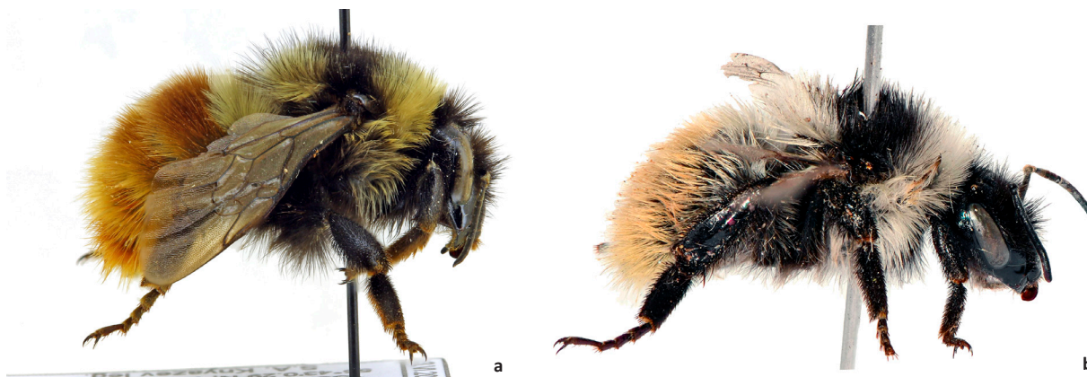
Image 1. Specimens of Bombus pomorum collected in Western Siberia: a—queen (© S. Knyazev) | b—worker (© A. Byvaltsev).