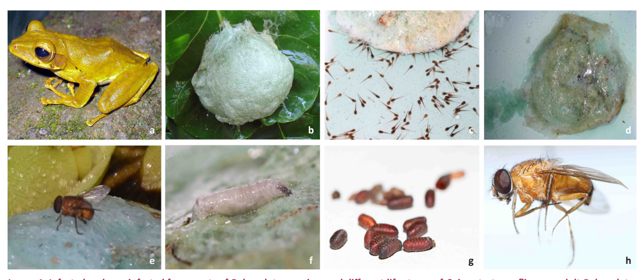
Image 1. Infected and non-infected foam nests of Polypedates cruciger and different life stages of Caiusa testacea flies: a—adult Polypedates cruciger | b—uninfected fresh foam nest attached to a Polyscias scutellaria leaf | c—tadpoles from an uninfected foam nest | d—putrefying foam nest due to C. testacea infection | e— C. testacea fly on a fresh foam nest | f— C. testacea 3^{rd} instar larva | g— C. testacea pupae | h— lateral aspect of adult C. testacea fly.

identified for them. Cerci short, backwardly bent, and with a pronounced distal separation between the apices in dorsal view. Base of cerci wide proximal to separation (Image 2A). In lateral view, surstylus rather broad and short, very gently curved below. Thoracic dorsum yellow and tergites 4 and 5 of abdomen with slight darkening and lack of metallic bluish sheen (Image 2D). A BLAST search of the GenBank database showed a 96.92% identity to available Caiusa testacea sequences together with a 100% query cover.