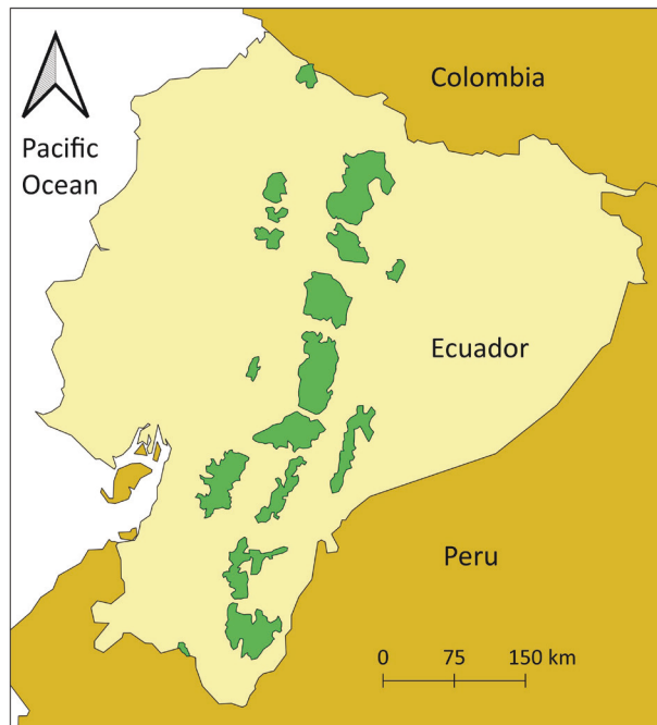
Figure 1. Andean Bear distribution range (green shapes) in Ecuador according to the IUCN Red List.

to the IUCN Red List in Ecuador. At the landscape level, vulnerability was calculated by the degree of representativeness, fragmentation, and connectivity. The threat to ecosystems was assessed by five variables: climate change, water resource use, forest exploitation, extraction of natural resources, and the probability of land conversion. Vulnerability and threat were classified in three categories (high, medium, and low) by using quantiles, and both indicators were combined to get five levels of fragility (very high, high, medium, low, and very low; Ministerio del Ambiente del Ecuador 2015a). No values were assigned to areas identified as non-natural ecosystems, such as crops, urban areas, or planted forests. These indexes provided by the Environmental Ministry have been used in previous scientific papers (e.g. Rivas et al. 2020).