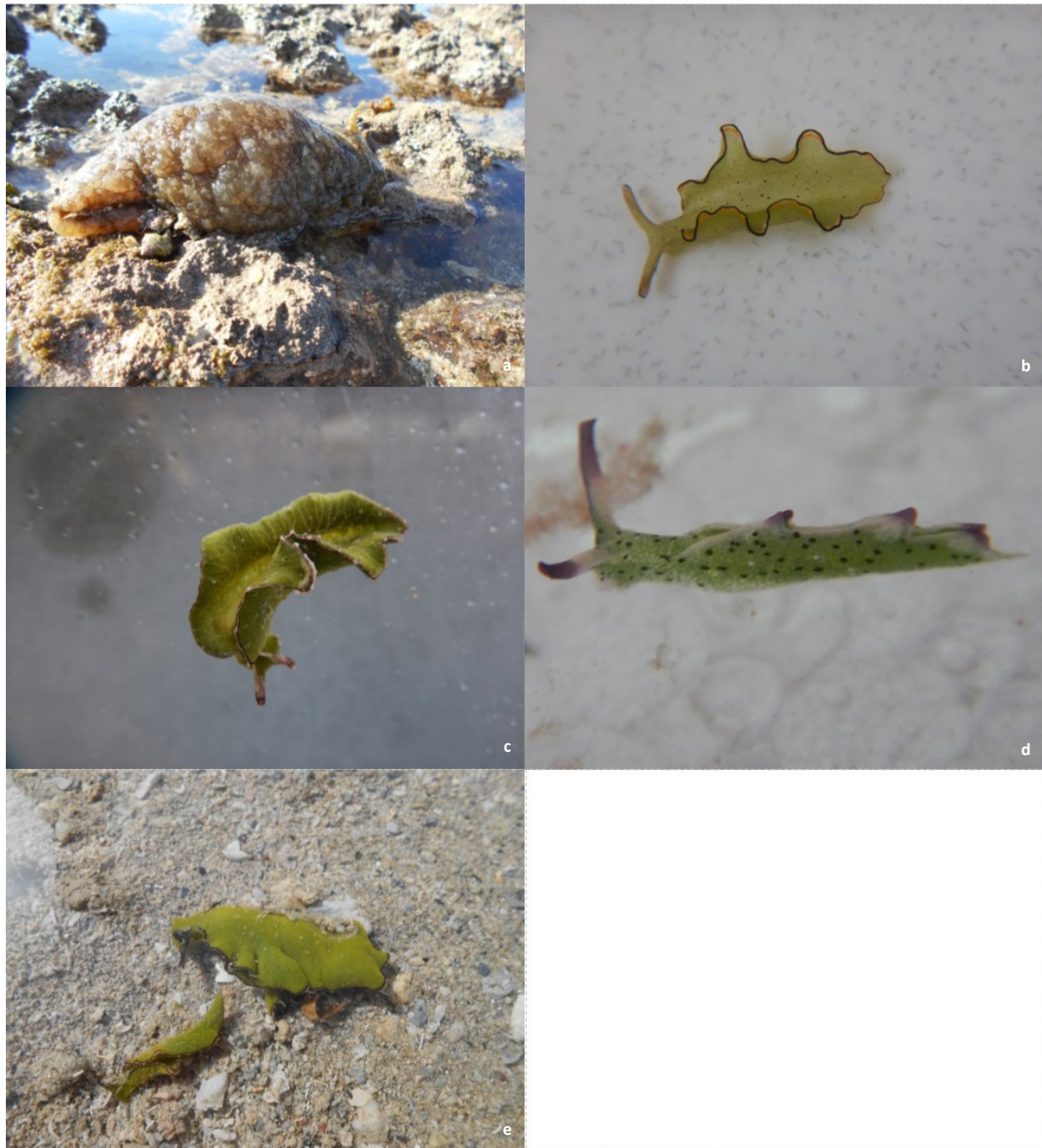
Image 5. a— Aplysia oculifera | b— Elysia ornata | c— Elysia expansa | d— Elysia thompsoni | e— Elysia tomentosa .

diversity of marine macrofauna and flora. This unique habitat should be conserved for future and further study can be done by exploring more hidden areas of coast. Local people, fishermen, researchers can be aware of this beautiful fauna's important in marine ecosystem through conducting a good awareness and education programs.