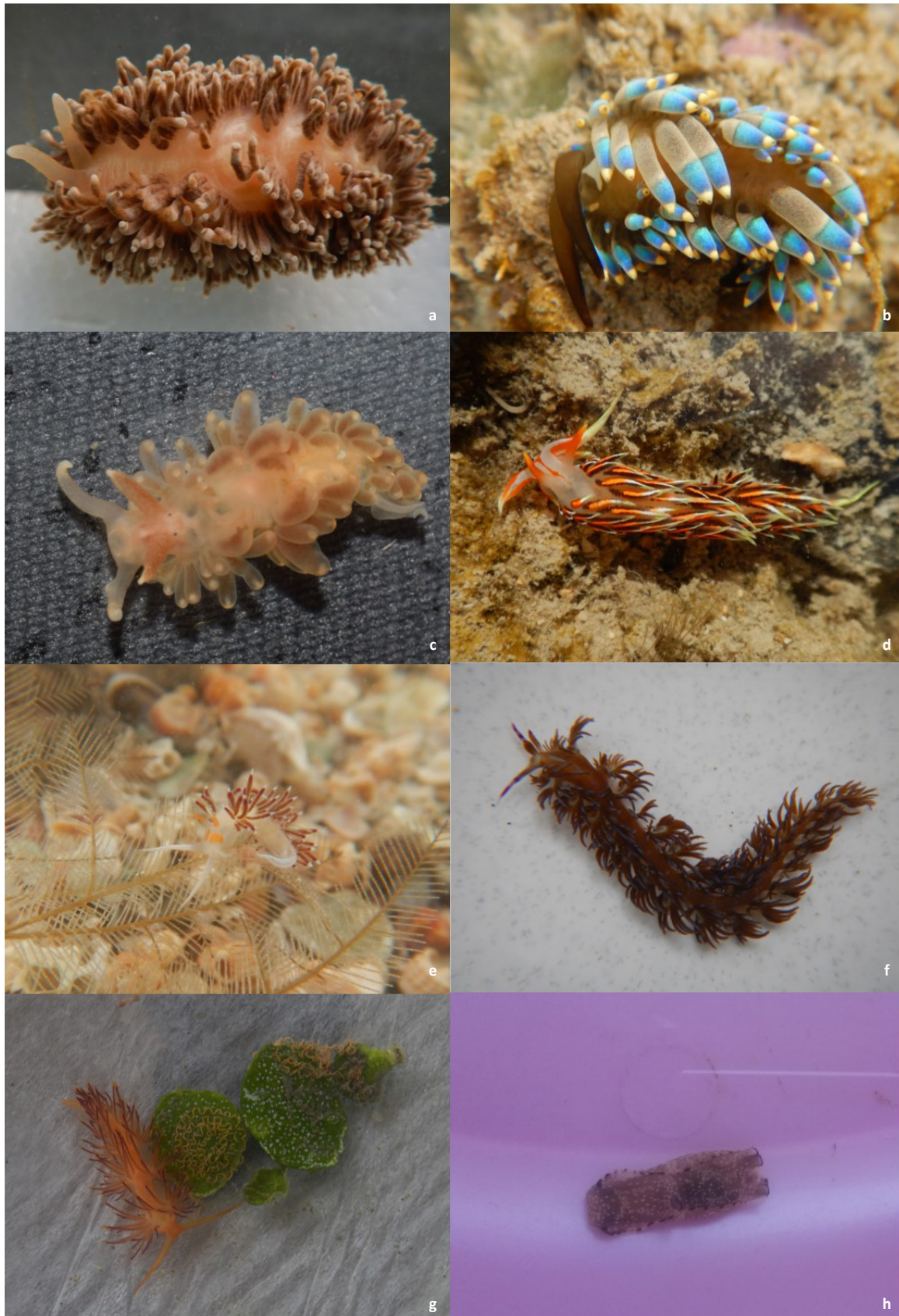
Image 4. a— Phestilla lugubris | b— Trinchesia yamasui | c— Antaeolidiella poshitra | d— Phidiana militaris | e— Cratena poshitraensis | f— Pteraeolidia semperi | g— Sakuraeolis gujaratica | h— Philinopsis speciosa.