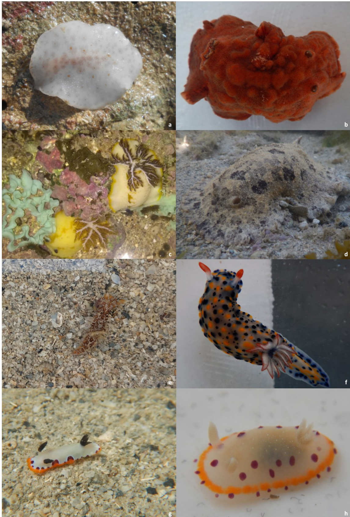
Image 2. a— Peltodoris murrea | b— Sclerodoris tuberculata | c— Taringa sublutea | d— Tayuva lilacina | e— Plocamopherus ceylonicus | f— Hypselodoris infucata | g— Goniobranchus fidelis | h— Goniobranchus bombayanus.