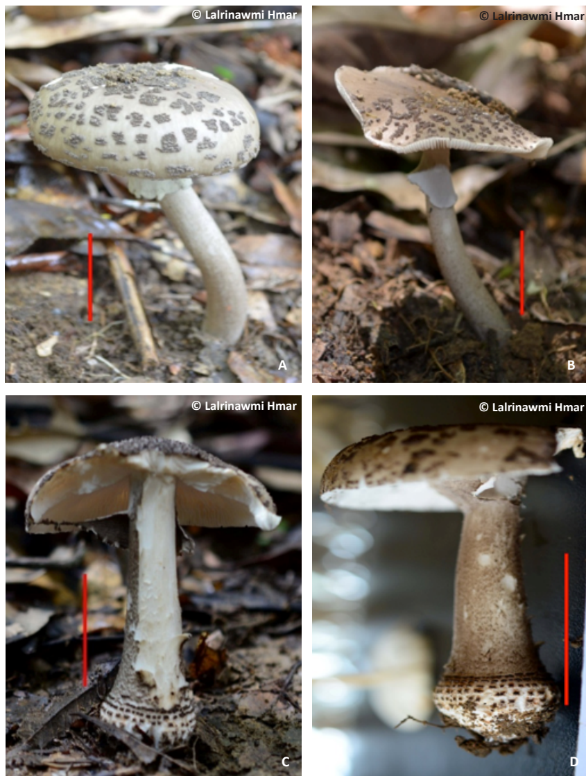
Image 1. A–C - Fruiting body of Amanita spissacea in their natural habitat; D - Fruiting body of Amanita spissacea in laboratory (scale A&B - 2cm; C&D - 4cm).

× 8–11 µm, four spored, sterigmata 3.2–4.6 × 0.8–1.8 µm. Clamp connection absent. Lamellae edge cell: clavate, 35–45 × 7.5–9 µm.