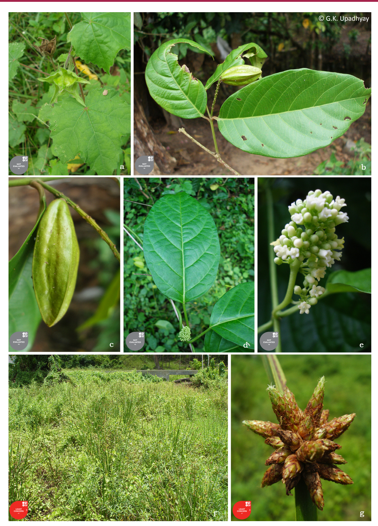
Image 1. a - Fioria vitifolia (L.) Mattei (fruiting twig); b–c - Combretum acuminatum Roxb. (fruiting twig and fruit close-up view); d–e - Marsdenia tinctoria R. Br., (flowering twig and inflorescence close-up view); f–g - Schoenoplectus mucronatus (L.) Palla (habitat and inflorescence close-up view)