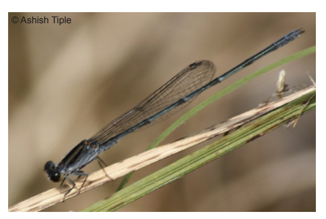
Imge 8. Pseudagrion spencei

VC - very common; C - common; R - rare; VR- very rare; * - new report