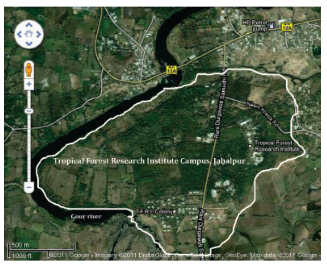
Image 1. Satellite overview map of study locality at the Tropical Forest Research Institute, Jabalpur.

campus. A biweekly survey was undertaken from 2009–2010 during the monsoon and post monsoon (July–August) periods. The adult specimens were identified with the help of identification keys provided by Fraser (1933, 1934, 1936), Mitra (2006), Subramanian (2005), Andrew et al. (2009), and Subramanian (2009). The odonates were categorized on the basis of their abundance in TFRI campus VC-very common (> 100 sightings), C - common (50–100 sightings), R - rare (2–15 sightings), VR - very rare (< 2 sightings) (Tiple et al. 2008).