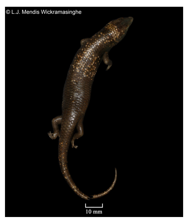
Image 6. Dorsal view of Dasia halianus deposited in 1906, collected from Elehara (North Central Province)

of distribution of D. halianus , in this locality could in fact be a mistake, which can very well be justified by the description of the type locality by Haly as "the hot and dry districts of Ceylon", where Gampaha on the contrary belongs to the wet zone. Regardless, our field studies confirm that D. halianus does not exist at the Gampaha locality today.