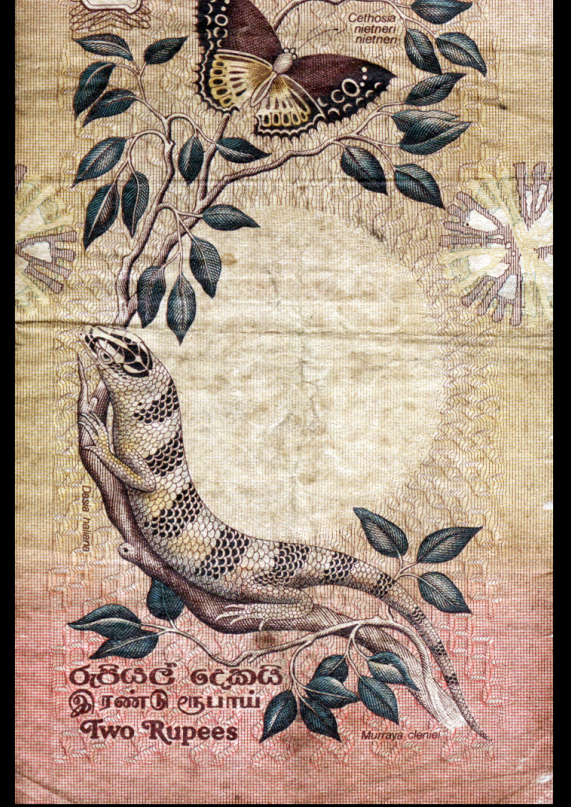
Image 8. A side of a Two Rupee note, of the Democratic Socialist Republic of Sri Lanka, printed in 1979, by the Bank of Ceylon.

В с-стра вор Остро Язоныта шарани оптива сентгал ванк ог сечион