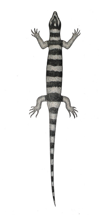
Fig. 1.—Young Theconyx halianus showing general form and coloration, from above. × 3.

From our studies in a fully grown tail there should be 10 to 12 black bands, hence according to the type description we can infer that the tail of the adult type specimen was regenerated. Also an important comment to be made on the type description is, "the single prefrontal touches both rostral and vertical." which could well be the fronto nasal and not the prefrontal, because there are two prefrontals and this never touches the rostral. The specimen collected by P.E.P. Deraniyagala, from Galatabendiyawa Estate (there is a mention about another specimen collected in 1935, which we were not able to locate in the NMSL collection) and another