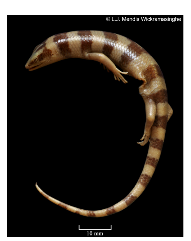
Image 1. The dorsolateral view of uncatalogued specimen of Dasia halianus in NMSL collection

lower border touching both loreal scales, but touching the posterior loreal more than half, the posterior border touching the first supraocular, and frontal; frontal slightly longer or equal in its distance to tip of snout, and approximately shorter or slightly equal in frontoparietals and interparietal combined; seven or eight supraciliaris; four supraoculars, first one longer than wide, second wider than long, first three in contact with frontal, third in contact with frontal and frontoparietal, fourth in contact with frontoparietal, parietal and upper pretemporal; frontoparietals distinct, slightly smaller than interparietal length; posterior tip of interparietal barely in point-contact with primary nuchal scales, parietal touching upper and lower pretemporal scales laterally, primary nuchal and three small scales touching parietal post laterally (Image 2A); non fused nasal and in contact with 1st supralabial; two loreal scales, anterior loreal touching nasal, supranasal, frontonasal, prefrontal, 1st and 2nd supralabials or 1st, 2<sup>nd</sup>, and 3<sup>rd</sup> supralabial scales. Posterior loreal longer, and wider than the anterior loreal, posterior loreal