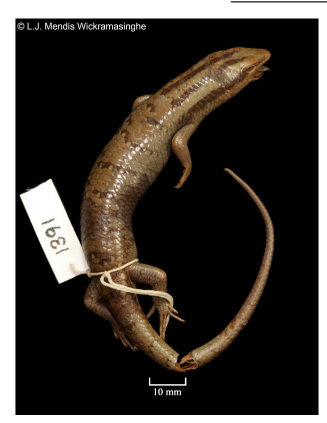
Image 3. The dorsolateral view of Dasia subcaeruleum BNHS 1391 (voucher specimen)

EW/EaW ratio 9.67); ear opening small (EL/HL ratio 0.06); snout to eye distance greater than the width of eye (SE/EW ratio 2.09). Body length equal in tail length (SVL/TL ratio 1.00), and round in cross section (TD/TW ratio 0.97).