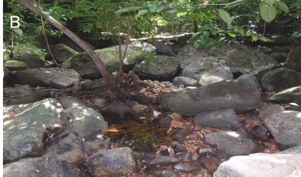
Image 2. Streams in Ebo Forest where the newly discovered populations of Louisea yabassi were collected: A—Stream-1 | B—Stream-2.

Deforestation has direct effects on the aquatic environment and indirect impacts from changes within the drainage basin, both of which will affect rare endemic forest species, such as L. yabassi , that depend on the forest canopy remaining closed and intact (Cumberlidge & Sachs 1991; Dudgeon et al. 2005; Mvogo Ndongo et al. 2018). Not only does deforestation expose aquatic systems and their inhabitants to the heating and drying effects of direct sunlight, but local farming practices also release pollutants such as agro-chemicals potentially affecting the eggs, hatchling-carrying females, and adults of L. yabassi . In addition, clearing the tropical rainforest leads to increased agricultural encroachment and firewood collection, which further impacts the habitat of L. yabassi .