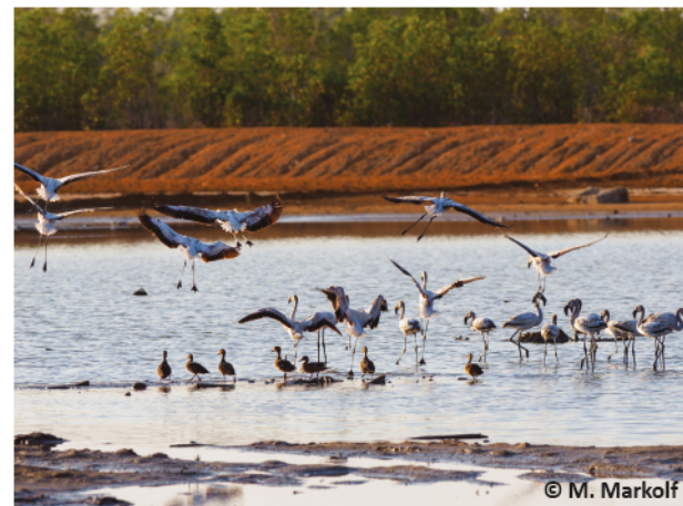
Image 4. Madagascar Teal and Lesser Flamingo at Tsangajoly saline pond.