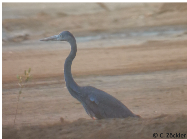
Image 6. Madagascar Heron at Tsangajoly saline ponds.