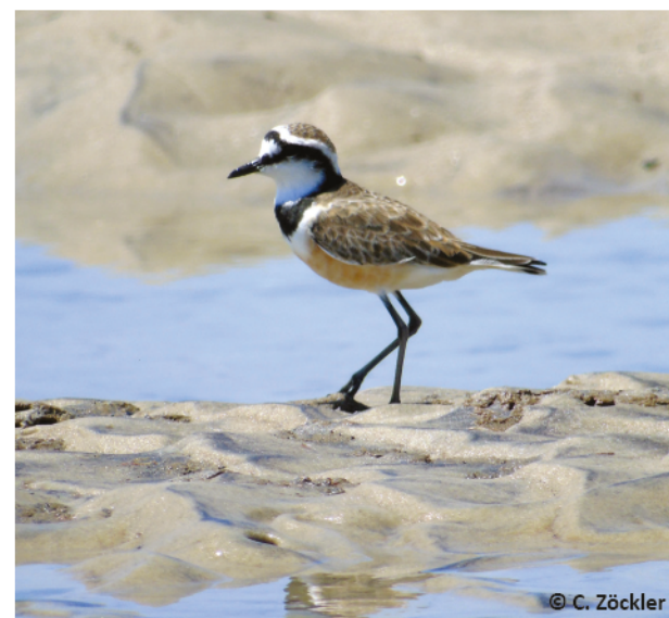
Image 5. Madagascar Plover at Andrahangy.