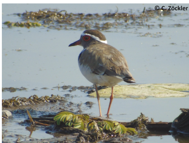
Image 8. Madagascar Three-banded Plover Charadrius bifrontatus in brackish water close Baobab Amoureux.

Red List as globally ‘Endangered’ and with estimated 1,000–1,700 mature individuals (BirdLife International 2016a) possibly the most threatened species observed. The species is well known from the MANAP, specifically Lac Bedo, which is also designated as a Ramsar site. Our survey adds one more occurrence for the Madagascar Teal in Andrahangy, which is about 2km away from Lac Bedo. Young et al. (2014) counted several birds in the salines of Menabe coastal wetlands and warned about fragmentation of the population. In total, we counted 30 birds simultaneously at Tsangajoly (Lodge de la Saline). As the area is large and difficult to survey it is likely that more birds are present. Although it is known that the species occurs in loose groups of up to 40 individuals outside the breeding season, such a high number of individuals at one place suggests that the ponds of the Lodge de la Saline represent a crucial refuge for this species. The total amount of birds (32) equals 1.9–3.2 % of the estimated global population. Population size increased north of the MANAP at Manambolamaty between 1999–2011 (Razanfindrajao et al. 2017).