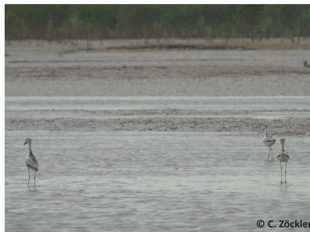
Image 9. Crab Plovers Dromas ardeola in Andrahangy.