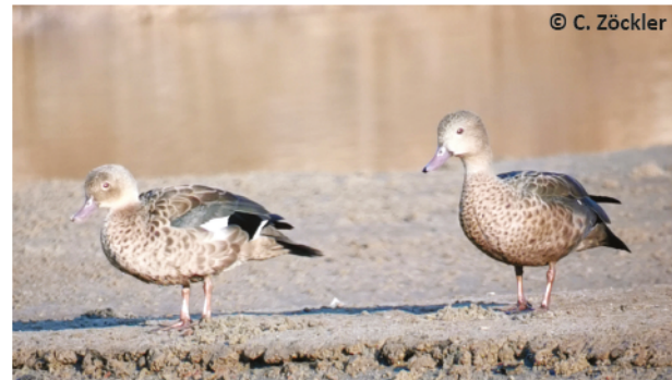
Image 3. Madagascar Teal at Tsangajoly saline pond.