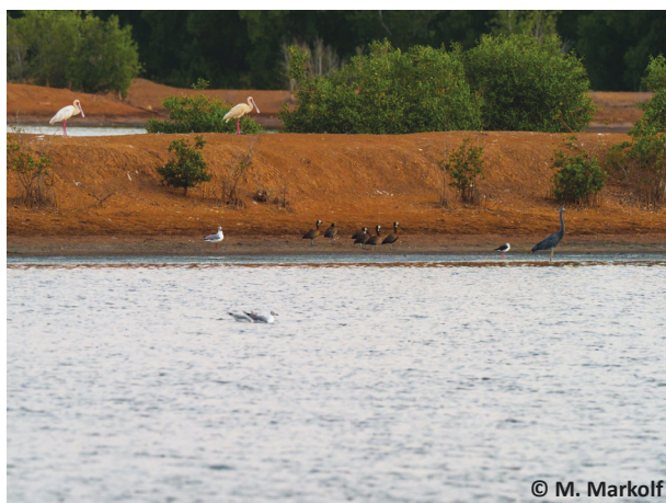
Image 7. African Spoonbill, Grey-headed Gull, White-faced Whistling Duck, and Madagascar Heron in a former shrimp pond at the Lodge de la Saline.