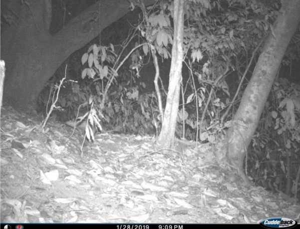
Image 1A & B. Asiatic Brush-tailed Porcupine photo captured in Mahananda Wildlife Sanctuary, West Bengal, 28 January 2019.

Beat, North Range, Mahananda Wildlife Sanctuary (Image 1A,B). The photo capture site was characterized by dense vegetation of plant species such as Baccaurea sapida , Bauhinia vahlii , Betula cylindrostachya , Castanopsis tribuloides , Cinnamomum obtusifolium , Duabanga grandiflora , Evodia fraxinifolia , Ostodes paniculata , Saurauia nepalensis , Schima wallichii , Semecarpus anacardium , Terminalia myriocarpa , and