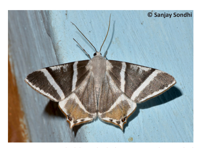
Image 3. Ourapteryx dierli , live individual, NCBS-BK945, photographed at Sarmoli, Munsiari on 23 May 2019.

hours. The live individual was photographed and collected (Image 1, 3).