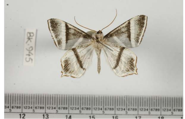
Image 1. Ourapteryx dierli, male NCBS-BK945, collected on 23.v.2019 at Sarmoli, Munsiari, Pithoragarh District, Uttarakhand. UP/UN.