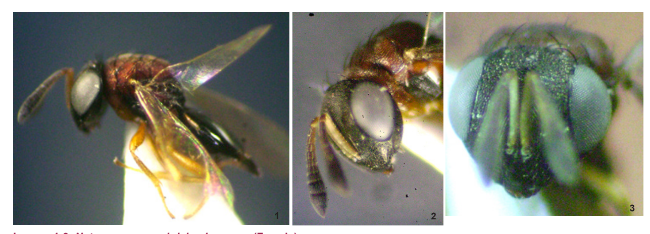
Images 1-3. Netomocera ramakrishnai sp. nov. (Female) 1 - Body in profile view; 2 - Head and part of thorax in profile view; 3 - Head in front view

at level of lower ocular line; pedicel plus flagellum slightly shorter than head width; scape 0.9x as long as eye, not reaching median ocellus and 6.5x as long as broad, anelli very small and transverse; pedicel 2.5x as long as wide and slightly longer than F1, F2 slightly shorter than F1, F2-F4 equal, F5-F7 almost equal, slightly shorter than