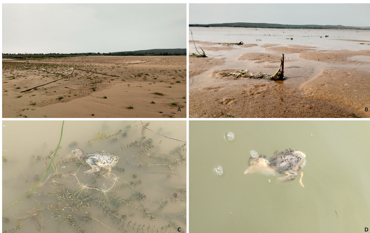
Image 1. Effect of Fani on breeding failure of sandbar-nesting birds along the Mahanadi River in the year 2019: A—damage of the nesting site protection fencing | B—flooding of nesting site | C—dead chick of Indian Skimmer | D—dead chick of River Tern.

VU—Vulnerable | NT—Near Threatened | LC—Least Concern.