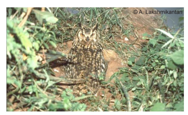
Image 4. Female on nest. Note the sleeked plumage (Human range ca. 28-30 m).

of only a few could be satisfactorily recorded and this photographic evidence is presented here.