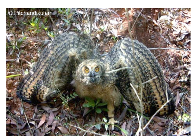
Image 1. Frontal view of intimidatory display of young Bubo bengalensis . Note that the wings are inverted and perpendicular to the ground.