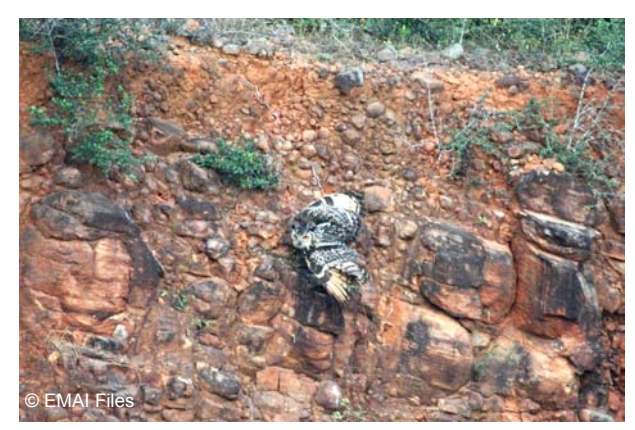
Image 3. Threat display in intra-specific circumstance (the other owl was outside the frame and to the left). Note that the wings are held flat and parallel to the surface on which it perched. The display was more pronounced before the observer distracted it, resulting in it turning and folding its wings slightly at the wrists. This is the only photograph we have been able to procure of the display – it is so hard to come by under normal circumstances (I have personally observed the display only 25 times since 1997 when I started work on the species, and that too at dusk and in bad light), that to encounter it during the day was a stroke of luck and to photograph it even more so.

Recently observations were also made at Nanmangalam Reserve Forest (12°55'N & 80°18'E) on the outskirts of Chennai adjacent to the Tambaram