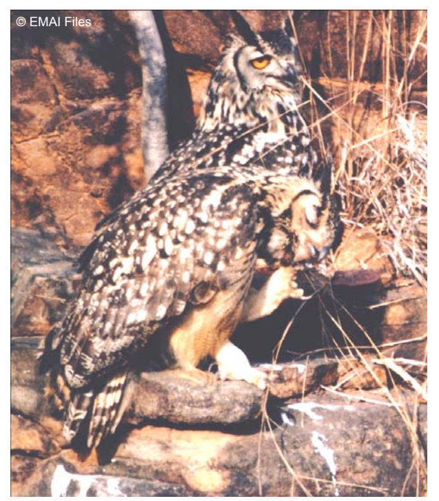
Image 11. Head scratching and preening (the male is in the background).