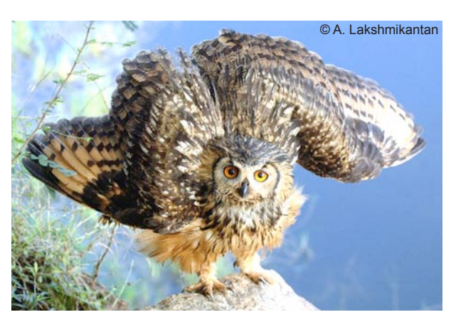
Image 7. Transition agonistic display. Note that the wings are neither parallel nor perpendicular to the ground (Human distance from the nest ca. 10-24 m).