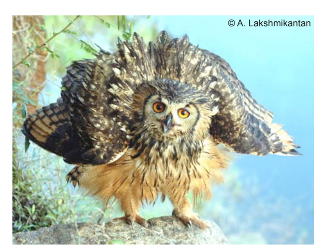
Image 8: Another phase of the transition agonistic display. This photograph shows another facet – i.e. the left wing behaving differently from the right wing. Whereas the right wing (left to the observers) shows a strong tendency towards the intimidatory display, the left wing shows a leniency towards the threat display. It is possible that in a state of strong conflicting emotions such phenomena are common.