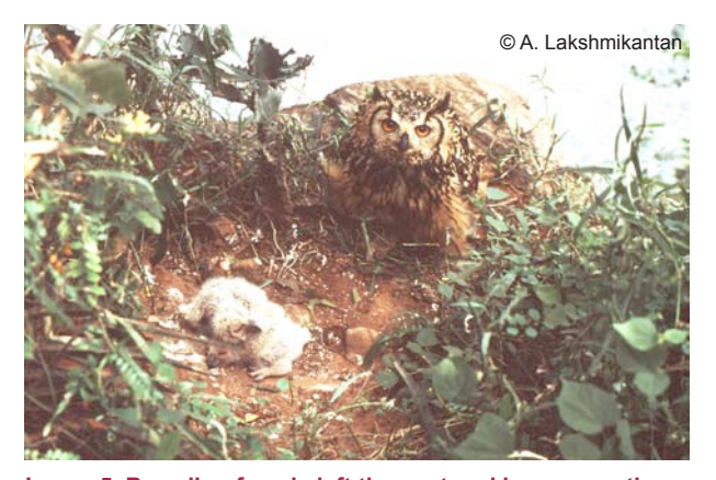
Image 5. Brooding female left the nest and began erecting body plumage, hissing, bill clapping and giving the alarm call (Human distance from nest ca. 24-30 m).

Prior to this only two spread-winged agonistic