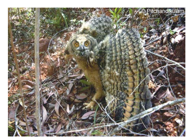
Image 2. Side view of intimidatory display of young Bubo bengalensis to emphasise the inverted and perpendicular slant of wings.

Plateau to the Aranya–Merveille area (11°58'N & 79°46'E) adjacent to Ousteri Lake. This area is deeply scoured with innumerable ravines and gullies and these provide ideal habitats for Bubo bengalensis. Five breeding pairs and their young were intermittently observed since 1997, especially at their nests. Twelve nesting instances were intensely observed, from the time the chicks hatched to the time they branched out, which took a month or so. These observations alone accounted for over 5,000 field hours. Ten approaches to the nests were made - the results of nine have been reported earlier (Ramanujam 2004) and the last has been reported along with photographic documentation here. In addition, bird watching sessions were concurrently held with pellet gathering exercises which was approximately 10-12 days a month for a couple of hours - accounting for over 1,200 field hours.