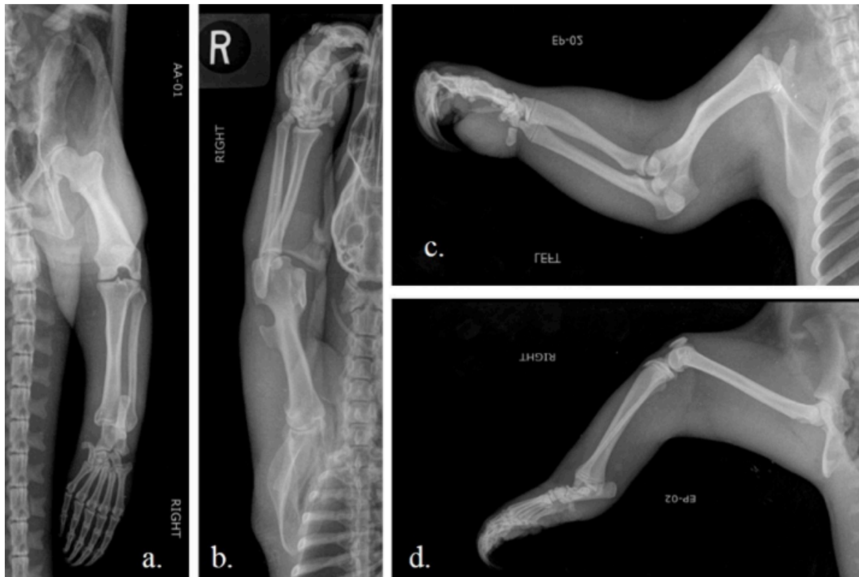
Figure 2. Four X-rays of complete T. mexicana normal extremities. Anteroposterior (AP) and lateral projections (L) are represented. a—AP projection of the pelvic limb | b—AP projection of the thoracic limb | c—L projection of the thoracic limb | d—L projection of the pelvic limb.

percentage of fractures were found in the cranial portion of the T. mexicana whilst the most commonly affected bones in cats were found in the caudal portion (such as, the femur (28.2%) and pelvis (24.8%). The same contrast was also noticed with dogs with more fractures observed in the pelvis (15.8%), the femur (14.8%) and the tibia (14.8%) (Phillips 1979). Reasons for a higher percentage of fractures found in the cranial portion of the T. mexicana is likely due to a combination of dense roadside habitat and the anatomy of xenarthrans whose plantigrade locomotion, coupled with short limbs, provides low agility and relatively slow locomotion (Ribeiro et al. 2017). They emerge from the forest onto the road, providing a driver with limited visibility and reaction time, and are often immediately hit by a vehicle in the frontal lateral position (Ribeiro et al. 2017).