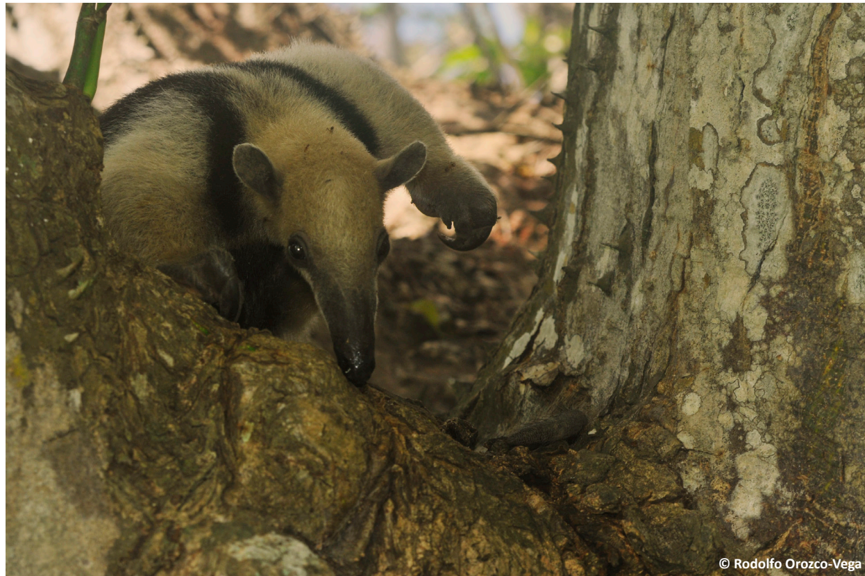
Image 1. Northern Tamandua Tamandua mexicana at Aranjuez, Pitahaya, Puntarenas Province, Costa Rica.

Descriptive epidemiological studies of wildlife are an important source of information about natural and non-natural hazards to wildlife populations (Molina-López et al. 2011) and consequently, studies that investigate the causes of mortality have become an important source for ecosystem health monitoring (Molina-López et al. 2011). One of the most common findings in animals hit by automobiles is the appendicular fractures (Minar et al. 2013) which can be surgically treated if an injured animal is taken to a rescue center. Understanding the normal