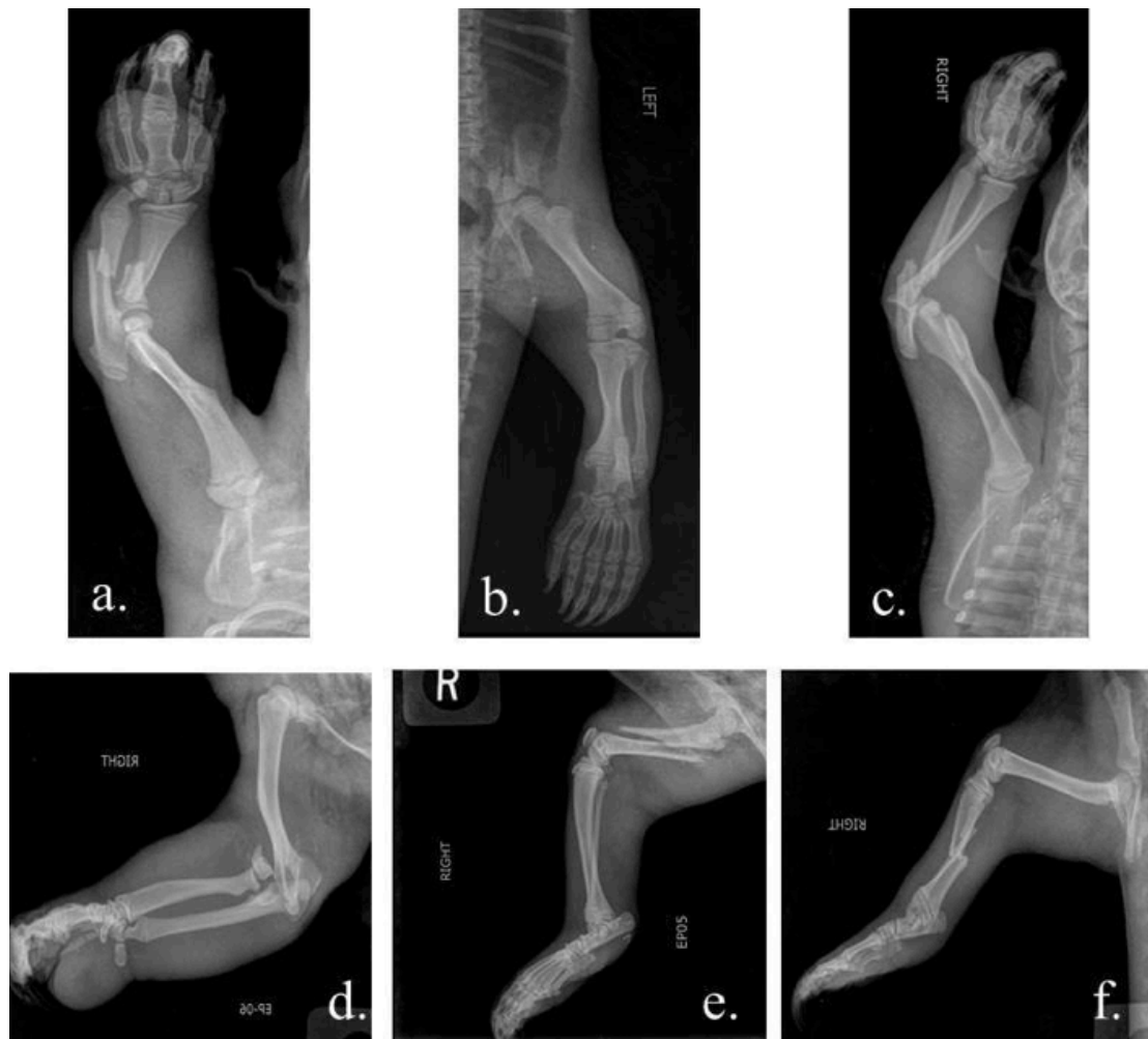
Figure 1. Selected x-rays of fractures in different bones from the ten roadkill T. mexicana collected between April and July 2016, on different roads in Costa Rica. Anteroposterior and lateral projections are represented. a—diaphyseal radio-ulnar fracture | b—distal ilial fracture | c—distal humeral fracture | d—distal humeral fracture | e—diaphyseal femoral fracture | f—diaphyseal tibial fracture