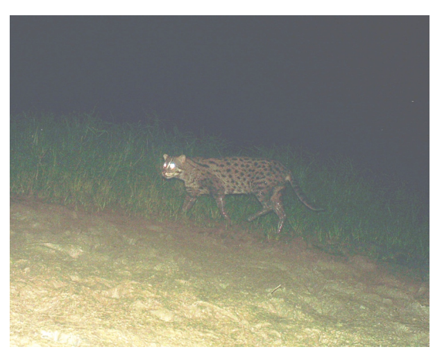
Image 2. Fishing Cat recorded by an automated game camera deployed at a commercial fish pond near Maubin on 11 May 2018.

Globally, poaching, subsistence hunting, retribution killings for livestock depredation are all considered threats to the continued survival of Fishing Cat populations (Mukherjee et al. 2016). That said, we have yet to find any evidence of widespread hunting of Fishing Cat in the Ayeyarwady Delta. The limited sample of villagers we talked to mentioned only the occasional capture of small wild cats, perhaps Fishing Cat, as bycatch in traps intended for civets. More extensive interview-based surveys (e.g., Platt et al. 2017), however, complemented by objectively triangulated information relevant to species identification are required to fully assess the threats posed by harvesting to Fishing Cats in the Ayeyarwady Delta. In addition to anthropogenic threats, MKWS harbours one of the largest remaining populations of Estuarine Crocodile in mainland southeastern Asia (Platt et al. unpub. data; Thorbjarnarson et al. 2000) and Fishing Cat is probably vulnerable to crocodile predation when foraging along tidal creeks. Although we are unaware of any verified records of crocodiles preving on Fishing Cats, similarsized terrestrial mammals are well-documented in the