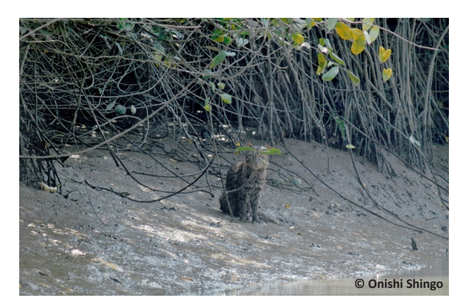
Image 1. Fishing Cat photographed along Polaung Chaung in Meinmahla Kyun Wildlife Sanctuary on 20 February 2016.

clearance, with agricultural expansion being the primary driver of deforestation in this region (Webb et al. 2014). Only about 25,000ha of mangrove forest remain in the delta, with MKWS containing the largest contiguous tract (Holmes et al. 2014; Webb et al. 2014; Harris et al. 2016). Although complacency is unwarranted, Fishing Cat appears capable of surviving in human-modified landscapes (Mukherjee et al. 2016) and may be less affected by mangrove forest loss than other wetland fauna. Janardhanan et al. (2014) even suggest that commercial fish ponds may enhance Fishing Cat populations by providing a source of readily obtainable food.