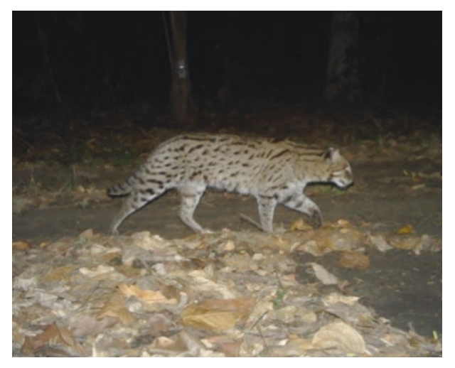
Image 2. Fishing Cat Prionailurus viverrinus on a forest road in Parsa National Park, Nepal. © Department of National Parks and Wildlife Conservation, National Trust for Nature Conservation, Zoological Society of London, 08 March 2016.