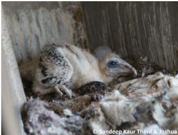
Image 6. Elder chick 24 days old