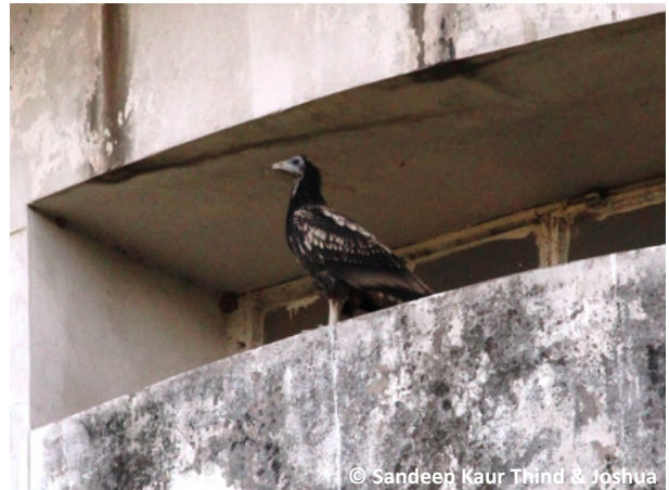
Image 9. Elder chick 94 days old