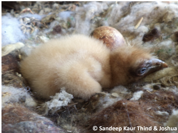
Image 5. Elder chick 3 days old