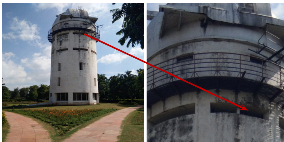
Image 1: Nesting site: Space Observatory, Punjabi University, Patiala.