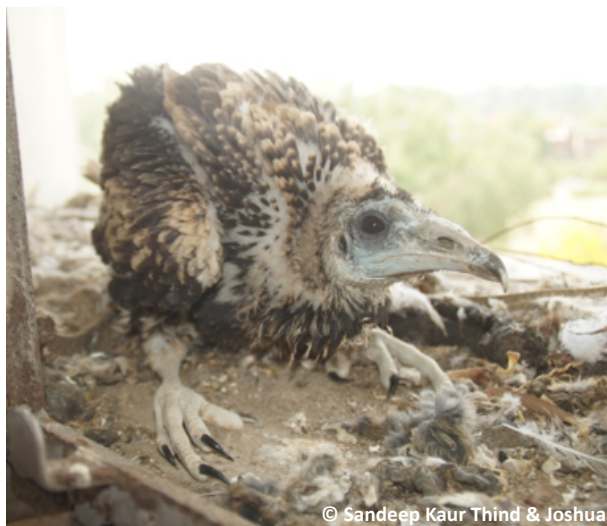
Image 7. Elder chick 33 days old

week, and then they started moving around the window platform. During this phase the parents were seen sitting on the observatory dome nearer to the nest window. The fledglings were observed out of nest platform exploring adjacent windows 94 days after hatching, and on the dome of the space observatory 98 days after hatching. They left the nesting site 112 days (16 weeks) after hatching. At the time of fledging they had a darker body, grayish face and short feathers on neck and crown.