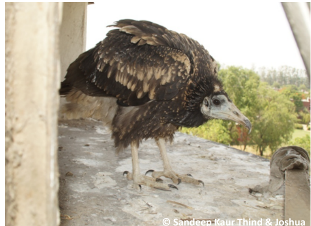
Image 8. Elder chick 54 days old