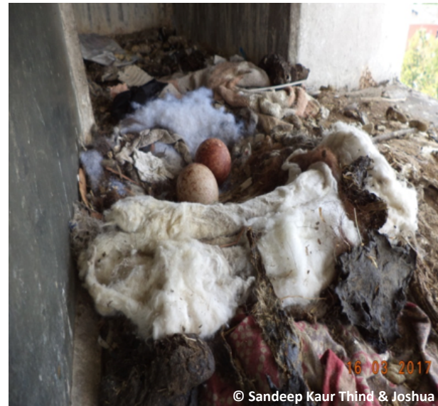
Image 2. Eggs in nest scrape.