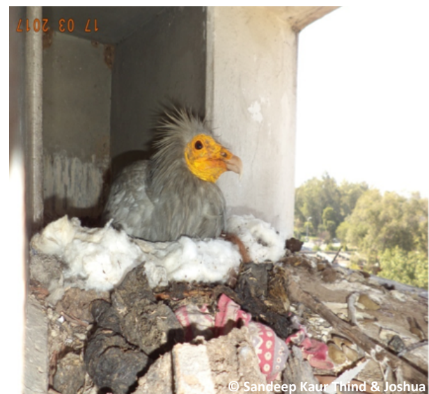
Image 3. Incubation by Egyptian Vulture - male.