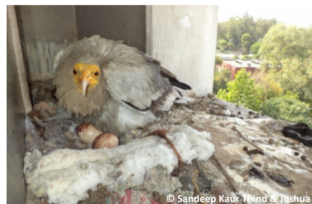
Image 4. Incubation by Egyptian Vulture - female.