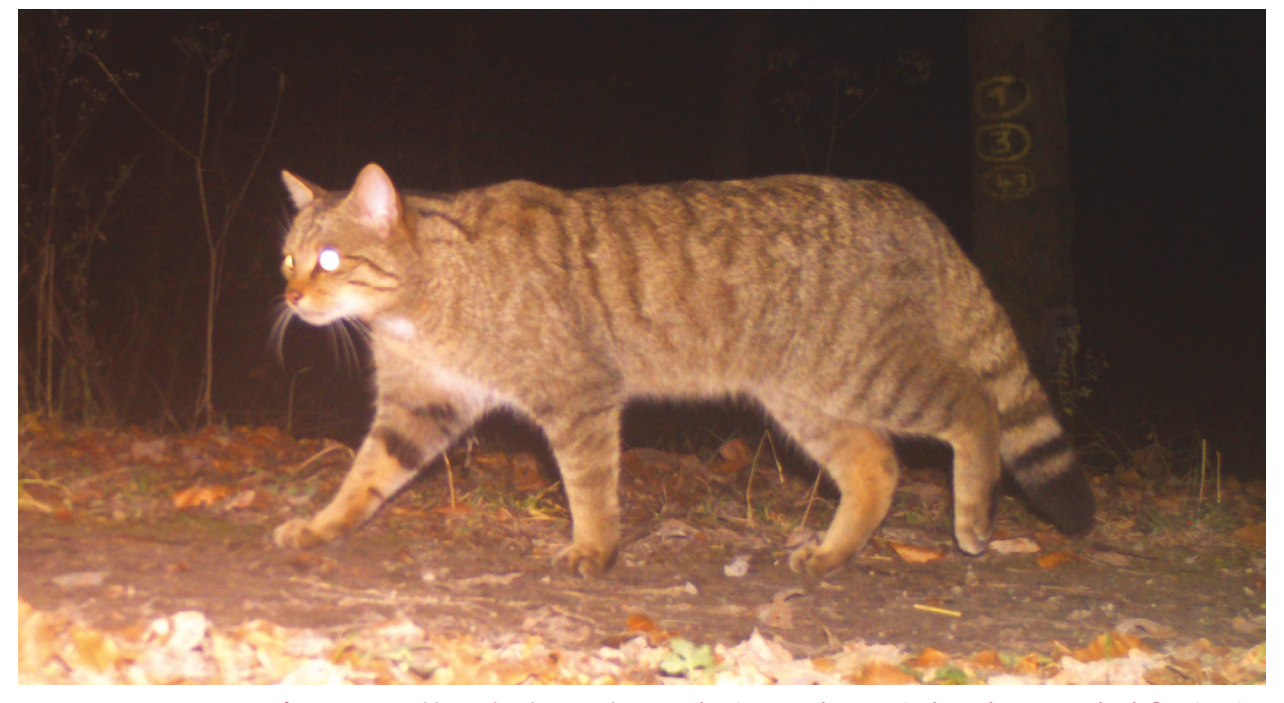
Image 1. Camera trap image of a European Wildcat Felis silvestris silvestris, taken in November 2016 in the Melsunger Bergland.