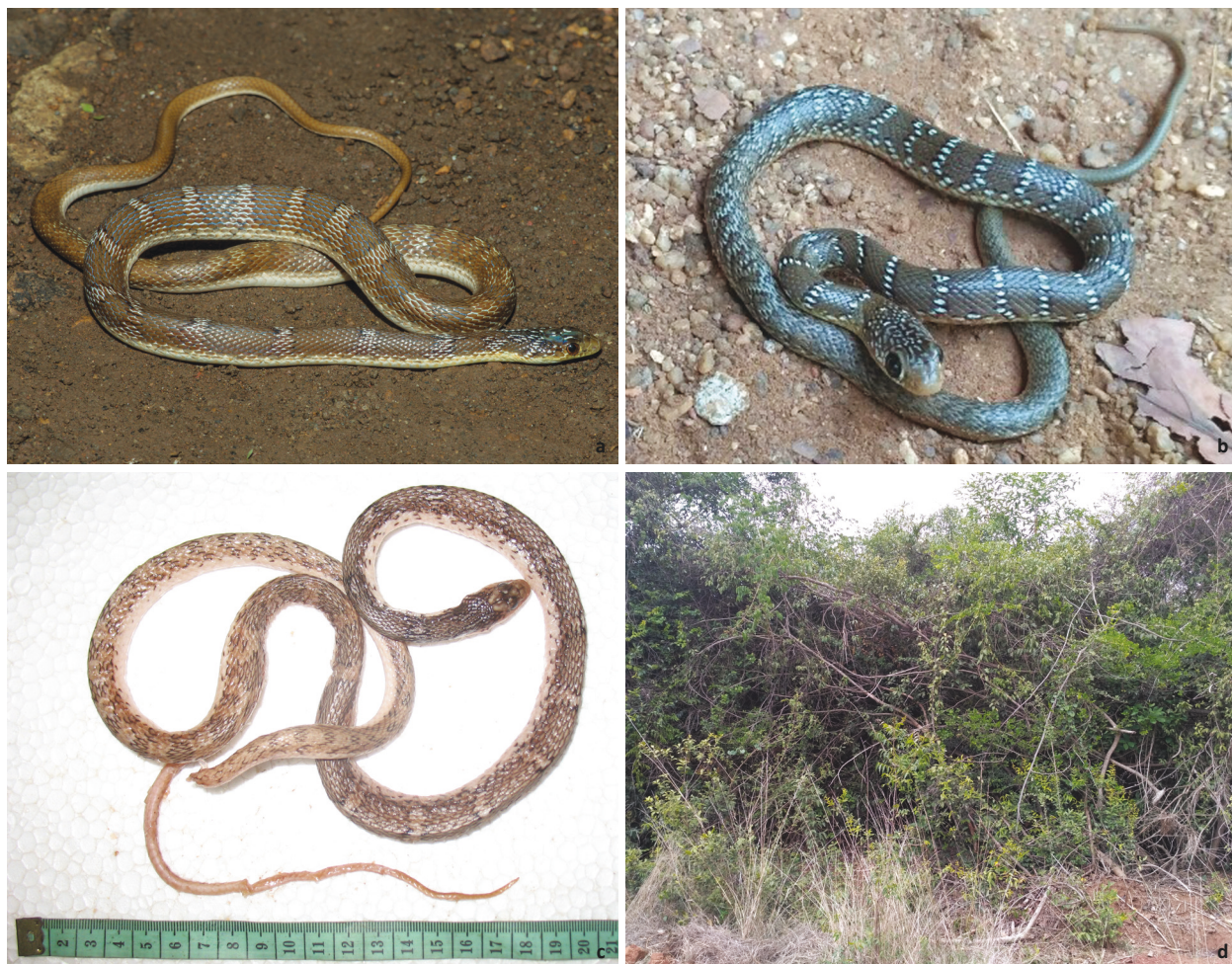
Image 1. Argyrogena fasciolata : a - living, uncollected adult from Auroville © N. Anandan | b - living, uncollected juvenile from Tambaram © S. Janani | c - CSPT/S-50b from Tuticorin © S.R. Ganesh | d - habitat showing dry evergreen vegetation in Tambaram © S. Janani.

Colouration in formalin: Dorsally brownish-grey to pale creamy-white, with off-white cross bars bordered with ashy black, visible or obscure; labia, lateral region, and venter white; eye black with greyish circular pupil.