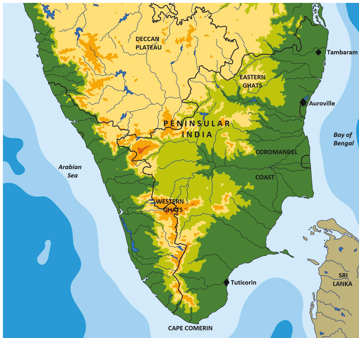
Figure 1. Map of southern India, depicting areas of new records of Argyrogena fasciolata from across the Coromandel Coast: Tambaram, Auroville and Tuticorin (black diamonds).

abutting the Ghats, with no further data. The Madras Christian College, where this species was now sighted, once donated specimens to the Madras Government Museum (Ganesh & Asokan 2010). It is surprising that when this happened half a century ago, no A. fasciolata specimen was obtained. Its occurrence in the related and nearby region of northern Sri Lanka is also debatable at best (Taylor 1950; Das 2002; Bauer & de Silva 2007; Abyerami & Sivashanthini 2008). Therefore, we hypothesize that the lack of sightings of A. fasciolata anywhere from southeastern India prompted literature (Whitaker & Captain 2004) to exclude the southeastern coast of India from the distribution of this otherwise widespread species. Our own field experience in the