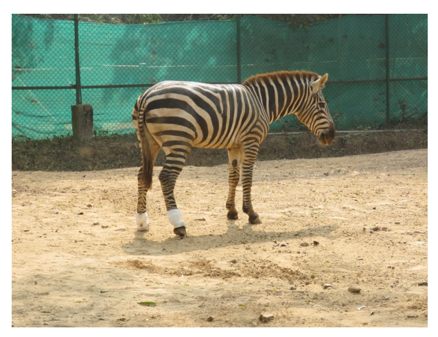
Image 2. Ailing Grant's Zebra in standing posture on 01.i.2017.

vitals like rectal temperature, respiration, and heart rate were recorded as 99.3°F, 12 breaths/minute, and 70 beats/minute, respectively. Both rectal temperature and respiration rates were within the normal range. Heart beats were on a higher side as against the reference value of 28–40 bpm. This transient increase could be correlated with the excitement during pre and post tranquillisation procedure.