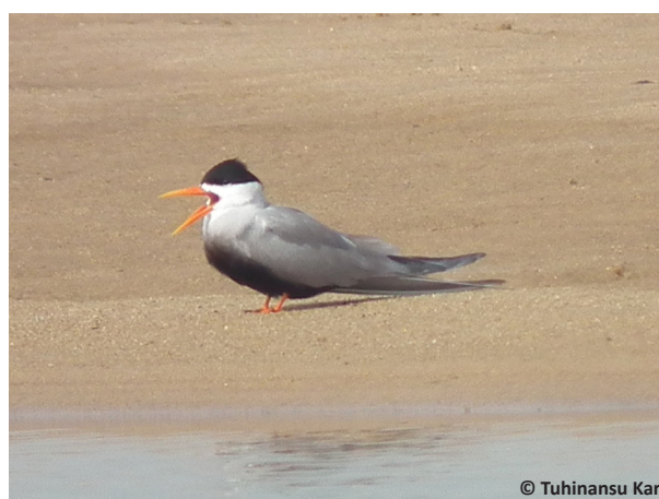
Image 1. An adult Black-bellied Tern in breeding plumage on an island in the Mahanadi River near Kakhadi in Odisha, eastern India

For the protection of the nesting sites and long-term conservation of the Black-bellied Tern, regular community awareness activities should be carried out to seek local support to minimize disturbances in the area during the breeding season. Coordination with the water resource department and the revenue department will be helpful in managing the water level and controlling sand mining activities, respectively, during the breeding season. Apart from that, in agreement with the recommendation given by Rahmani (2012), Rahmani & Nair (2012), and BirdLife International (2017), further targeted surveys, particularly during the breeding season, along the entire length of the Mahanadi River and other large rivers are essential to understanding the status of the Black-bellied Tern in Odisha. The results of these will be helpful in reassessing the global status of the species and formulating conservation plans for the future.