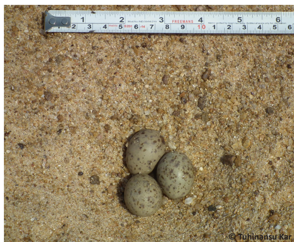
Image 2. Black-bellied Tern nest with eggs on an island in the Mahanadi River near Mundali in Odisha, eastern India