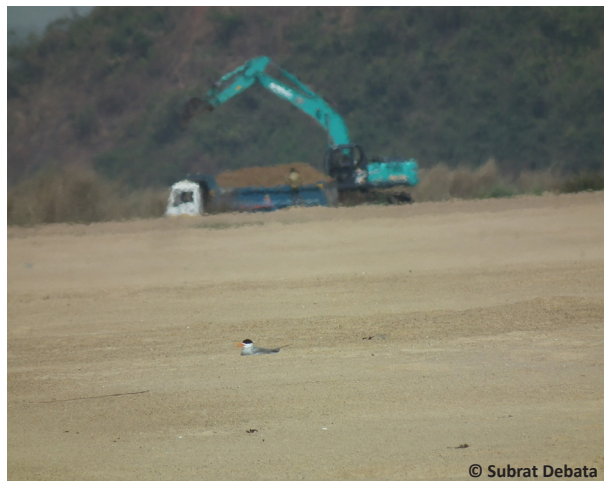
Image 3. A Black-bellied Tern incubating its eggs on an island in the Mahanadi River in Odisha, eastern India. Sand mining is a regular activity near these breeding and nesting sites at Mundali.