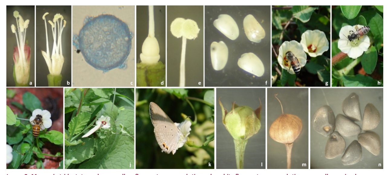
Image 2. Merremia tridentata: a - lemon yellow flower stamens and stigma; b - white flower stamens and stigma; c - pollen grain; d - ovary; e - capitate stigma; f - ovules; g - Apis florea collecting pollen from lemon yellow flower form; h - Apis florea collecting pollen from white flower form; i - Apis cerana collecting nectar from white flower form; j - Catopsilia pomona collecting nectar; k - Chilades pandava; I & m mature and dry fruits; n - seeds.