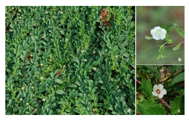
Image 1. Merremia tridentata: a - habit; b - white flower; c - lemon yellow flower with dark reddish throat. @ A.J. Solomon Raju

year. A closer examination of the flowers of different populations indicated that the plants produce two floral colour forms, one exclusively white flowers (Image 1b) and the other lemon yellow with a dark reddish throat (Image 1c). But, individual plants produce only one flower form. The plants of lemon yellow with dark reddish throat flower form are most common. The plants of the two floral colour forms grow either intermingled with each other or grow displaying distinct populations. The number of twining branches per plant is 18.2 ± 6.46 in white flower form and 24.4 ± 10.90 in lemon yellow flower form during the rainy season. The plants of the yellow flower form are more profuse and spreading than the plants of the white flower form. The flowers are pedicellate (17mm long), solitary, densely villous and borne in leaf axils. They appear quite distinct against the foliage. The plants of both the flower forms with profuse spreading branches with many solitary flowers in a scattered appearance is quite attractive during the flowering season.