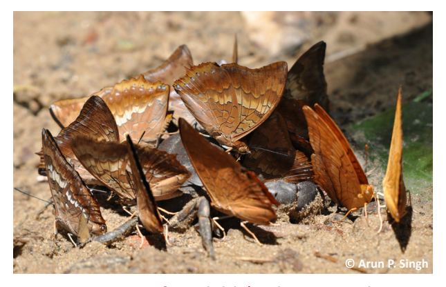
Image 9. Congregation of Nymphalids (Rajahs: Tawny Rajah Charaxes bernardus hierax & Yellow Rajah Charaxes marmax marmax; Crusier Vindula erotaerota) feeding on fluids of a dead crab in Dehing-Patkai Wildlife Sanctuary (September).