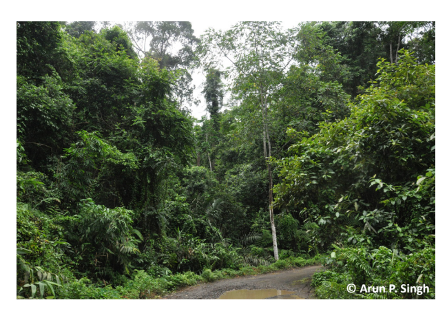
Image 4. Jeypore Reserve Forest with cane brakes (Jeypore-Deomali road on Assam-Arunachal Pradesh border; Burhi –Dehing river)