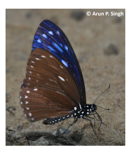
Image 13. Great Blue Mime Papilio paradoxa telearchus Hewitson, 1852