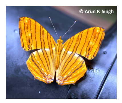
Image 28b. Common Maplet Chersonesia risa Doubleday, 1848-only for comparision with Wavy Maplet (Image 28a).