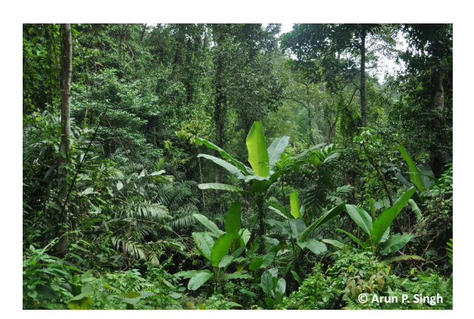
Image 1. Tirap Reserve Forest (along the Tirap River on Arunachal Pradesh border)