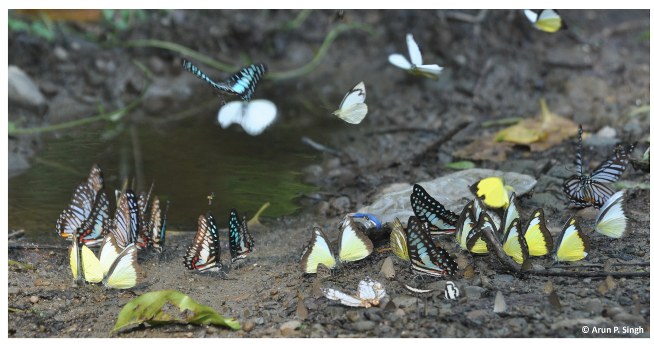
Image 7. Congregation of all five families of butterflies on the road in Jeypore Reserve Forest (June).