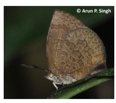
Image 16. Hooked Oakblue Arhopala paramuta paramuta de Niceville, 1883