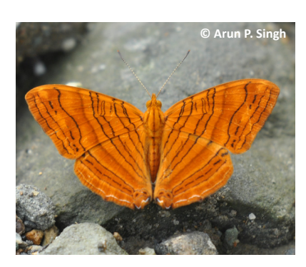
Image 28a. Wavy Maplet Chersonesia intermedia rahroides Moore, 1899