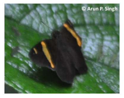
Image 40. Dark Yellow-banded Flat Celaenorrhinus aurivittata aurivittata Moore, 1878