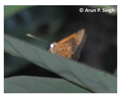
Image 39. Indian Yellow-vein Lancer Pyroneura margherita Doherty, 1889