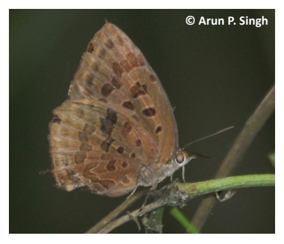
Image 17. Sylhet Oakblue Arhopala silhelensis silhetensis Hewitson, 1862