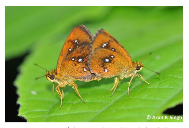
Image 11. Mating pair of Chestnut Bobs Lambrix salsala salsala in Tirap ReserveForest, Tinsukhia District, Assam (September).