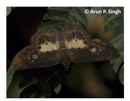
Image 38. Dusky Yellow-breast Flat Gerosis phisara phisaraMoore, 1884