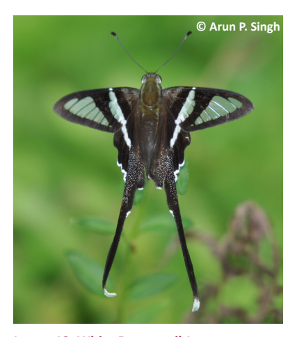
Image 12. White Dargontail Lamproptera curius curius (Fabricius, 1787)