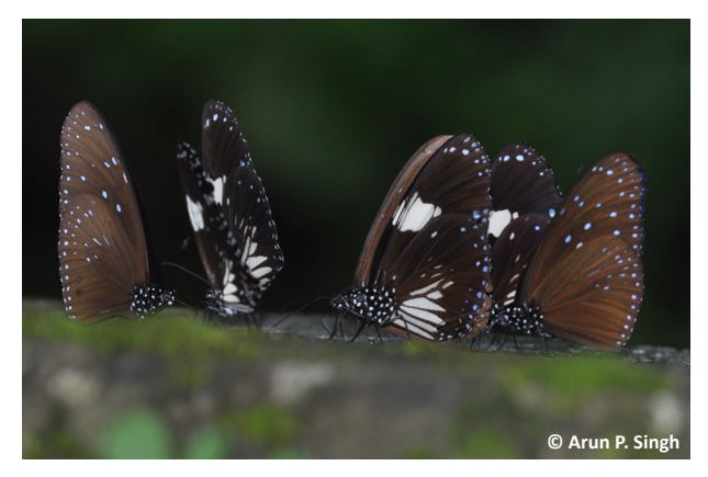
Image 8. Congregation of Danaids (Magpie Crow Euploea radamanthus & Blue Spotted Crow Euploea midamus rogenhoferi) in Jeypore Reserve forest (June).