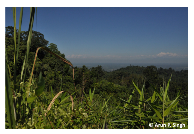
Image 5. Tipong Reserve Forest (Assam-Arunachal Pradesh border with Changlang District & Tipong river)