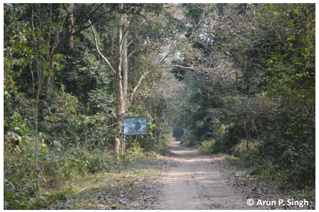
Image 2. Bhorjan Reserve Forest, near Tinsukhia Town - potential site for butterfly inclusive ecotourism

five month period during most of the seasons of the year (February: mainly winter; March: spring; June: pre-monsoon/dry summer; 31 August—September: monsoon; November: winter). The altitudinal range covered varied from 85m (lowest) in Padumoni RF near the Bhramaputra River basin to as high as 471m (highest) in Tipong RF-Lekhapani RF tract, bordering Changlang District of Arunachal Pradesh.