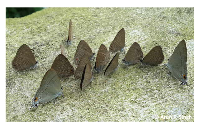
Image 10. Congregation of Lycaenids (Common Ciliate Blue Anthene emolus emolus & Common Tit Hypolycaena erylus himavantus) in Jeypore Reserve Forest in June.