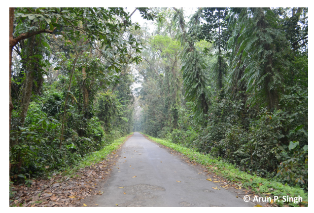
Image 3. Bherjan Reserve Forest, near Tinsukhia Town - potential site for butterfly inclusive ecotourism