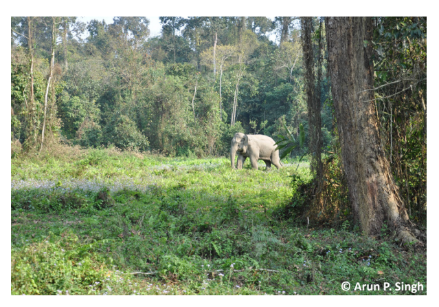
Image 6. Forest sampling site in Dehing-Patkai Wildlife Sanctuary (Digboi-Duliajan Road).

Identification of butterflies was carried out on the spot during sampling or from photographs taken in the field as the majority of the species was photographed (Images 7–43 [12-42 are endemic to northeastern India]). For identification the field guides and papers (Evans 1932; Wynter-Blyth 1957; Smith 2006; Kehimkar 2008; Singh 2011; Gogoi 2012, 2013a; Sondhi et al. 2013; Sondhi & Kunte 2014; Smetacek 2015) and web resources (http://www.ifoundbutterflies.org/; http://flutters.org/), were used. Nomenclature was followed using the website http://www.nfic.funet.fi/pub/sci/bio/life/insecta/lepidoptera/ ditrysia/ papilionoidea/