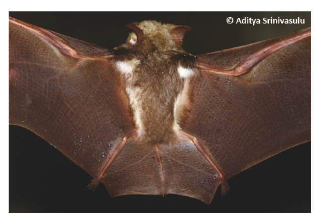
Image 1. Mason's Diadem Leaf-nosed Bat H.d. masoni from Baratang Island, Andaman Islands, India

using MUSCLE (Edgar 2004) incorporated in MEGA6 (Tamura et al. 2013) using default parameters. The alignment was processed in Gblocks v0.91b (Castresana 2000) and the final alignment of 581 bp was used for phylogenetic analysis. ModelTest (Posada & Crandall 1998) in conjunction with MEGA6 was used to choose the best fitting maximum likelihood DNA substitution model for the combined dataset, based on the corrected Bayesian Information Criterion (BICc) scores for each model type. The model chosen for the given data by ModelTest based on least BICc was TN93+I (Tamura-Nei + Invariant sites) (Tamura & Nei 1993). The chosen model for the combined dataset along with obtained likelihood parameters was used to generate a maximum likelihood (ML) tree through MEGA6. Bayesian analysis was carried out in BEAST v1.8.2 (Drummond et al. 2012) using default priors. The data were partitioned into ingroup and outgroup sets and the substitution model used was based on the results of ModelTest. The program was run for 10 million generations and tree sampling was made every 1000 generations. At the end of the analysis, the standard deviation of the split frequencies was below 0.01. Convergence was double checked using Tracer v1.6 (Rambaut et al 2014) to plot the likelihood scores against the generations. The first 25% of the total number of saved trees were discarded as burn-in and a majority consensus tree was made using TreeAnnotator, included in the BEAST v1.8.2 package.