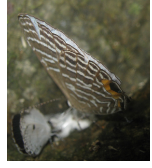
Image 14. White Cerulean Jamides cleodus pura (Kaziranga) upperside