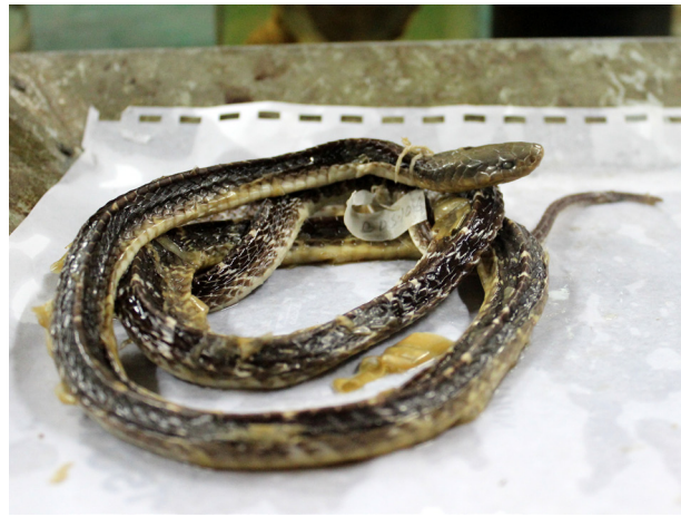
Image 24. Preserved specimens from the museum, Department of Zoology, University of Chittagong - Bungarus caeruleus Common Krait Voucher no. 124CU