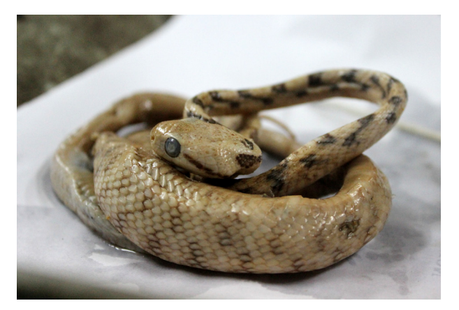
Image 23. Preserved specimens from the museum, Department of Zoology, University of Chittagong - Boiga cynodon Bengal Cat Snake Voucher no. 120CU