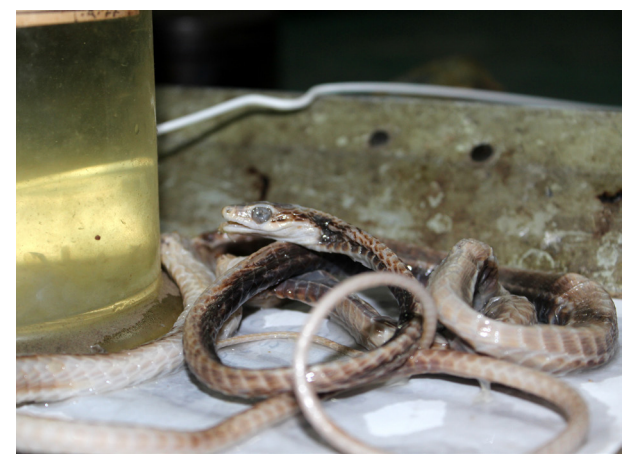
Image 22. Preserved specimens from the museum, Department of Zoology, University of Chittagong - Dendrelaphis tritis Common Bronzeback Tree Snake Voucher no. 8CU