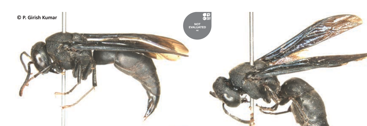
Image 20b. Anterhynchium abdominale bengalense (de Saussure) Male.

Image 21. Anterhynchium mellyi (de Saussure) Male.