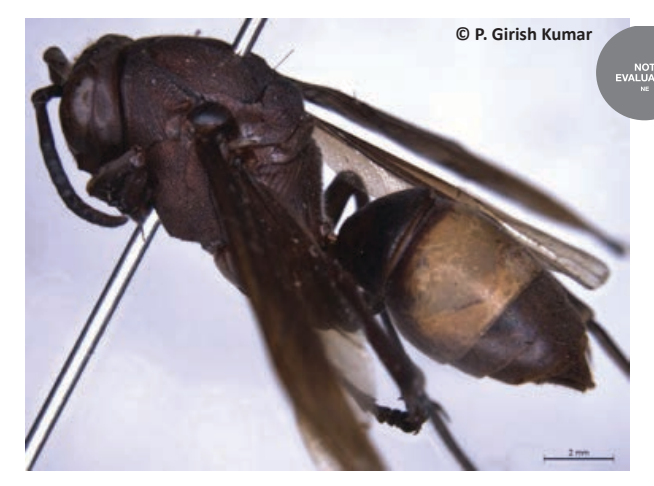
Image 5. Polistes (Polistella) strigosus strigosus Bequaert Female.

India, coll. S.K. Gupta & party; 14483/H3 & 14484/H3,female, 24.iv.1975, Raipur Library, Raipur District,Chhattisgarh, India, coll. S.K. Gupta & party.