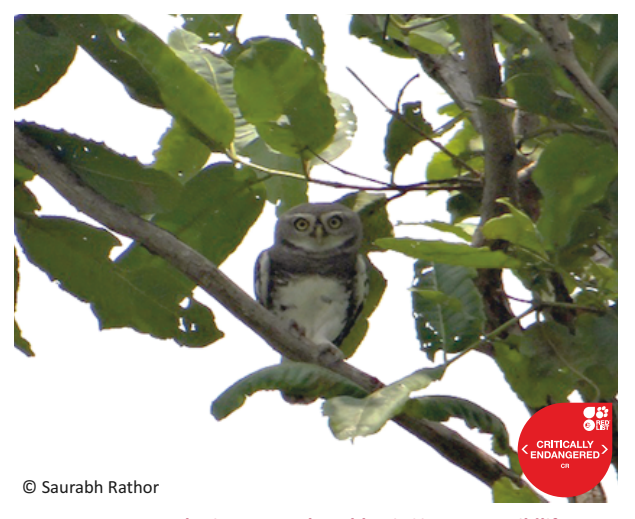
Image 2. Forest Owlet in Heteroglaux blewitti in Purna Wildlife Sanctuary, Gujarat.