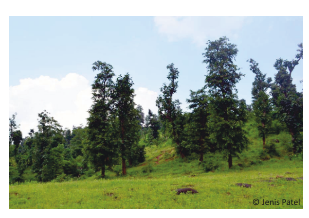
Image 1. Forest Owlet Heteroglaux blewitti habitat in Purna Wildlife Sanctuary, Gujarat.