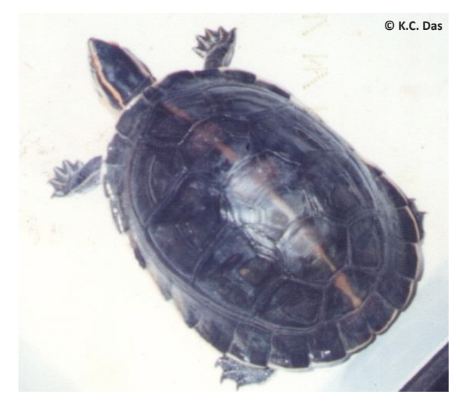
Image 1. Two live specimens of Cuora amboinensis: a - male; b - female found near Jirighat, Cachar, Assam.