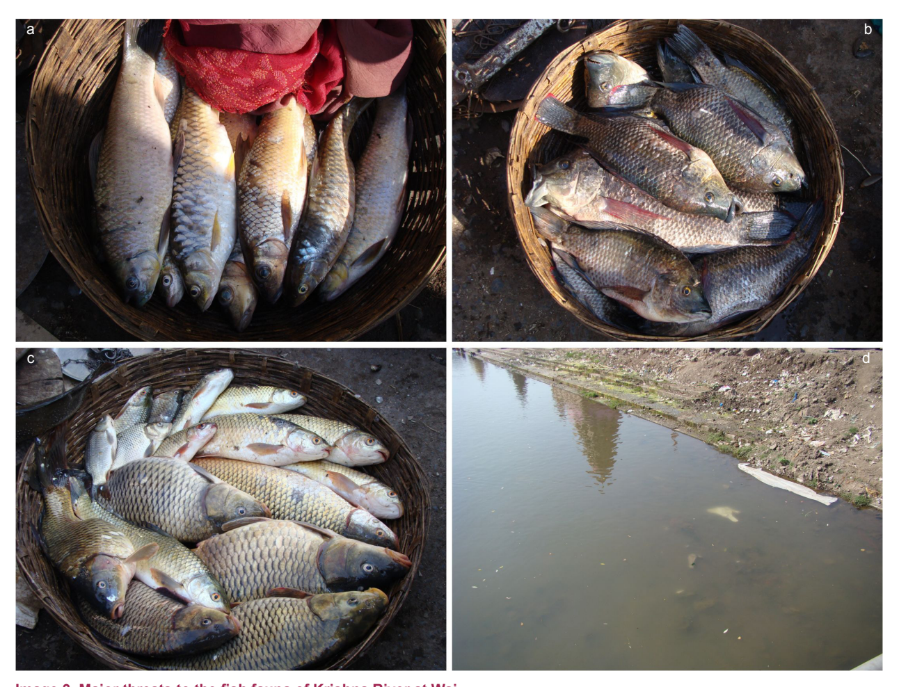
Image 3. Major threats to the fish fauna of Krishna River at Wai. a - Heavy harvesting of threatened species such as Schismatorhynchos nukta, Tor khudr ee and Tor mussullah ; b - introduced alien species such as Oreochromis mossambicus ; c - culturing of transplanted fish species such as Cyprinus carpio and Cirrhinus mrigala in Dhom reservoir; some of which have established populations even in the river below the dam; d - pollution of the river stretch.

Hypselobarbus curmuca as EN owing to the fact that the species is threatened throughout its range by habitat destruction and targeted fishing, which might have lead to population decline by more than 50% in the last 10 years whereas, Raghavan & Ali (2011) assessed Hypselobarbus kolus as VU based on population decline of 30-40 % in the wild populations within last ten years due to overexploitation, destructive fishing practices and decline in the quality of habitat. In the book by Jayaram (2010), considered H. kolus a junior subjective synonym of H. curmuca and the genus is considered valid as Gonoproktopterus. both H. kolus and H. curmuca are indeed one and the same species then the species G. curmuca might have a different threat status or it might be assessed as Least Concern (LC) based on the wide distribution. This uncertainty in taxonomic status and its effects