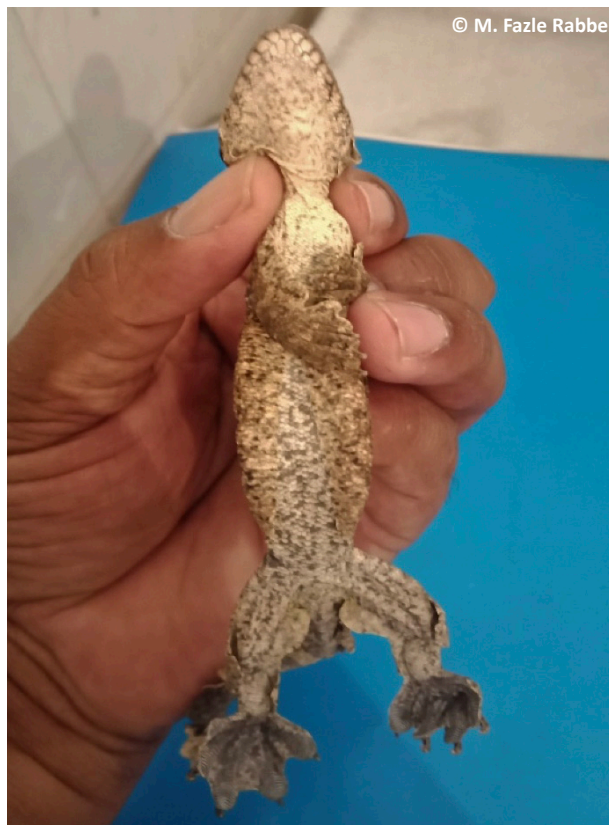
Image 2. Ventral view of Gekko lionotum