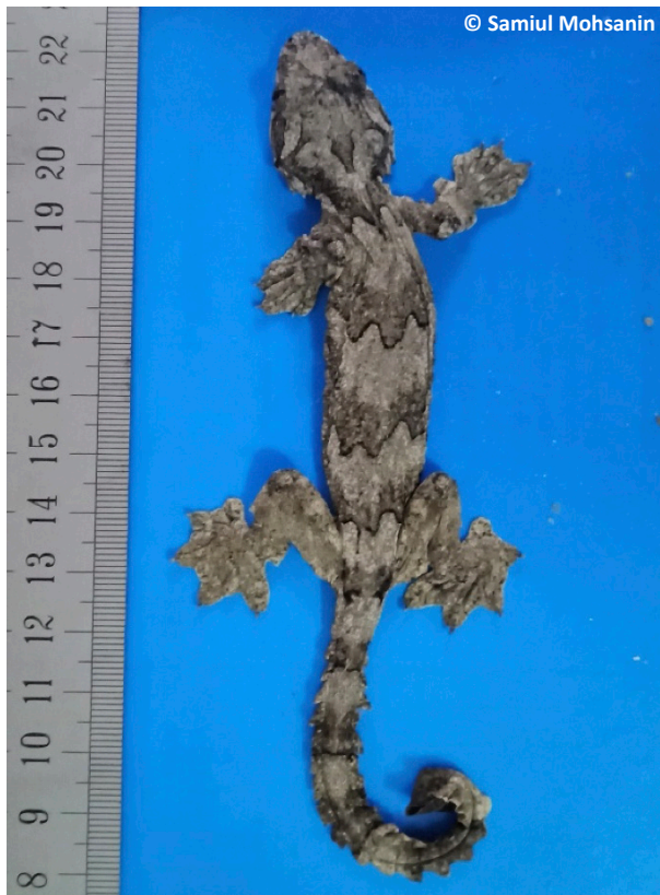
Image 1. Dorsal view of Gekko lionotum